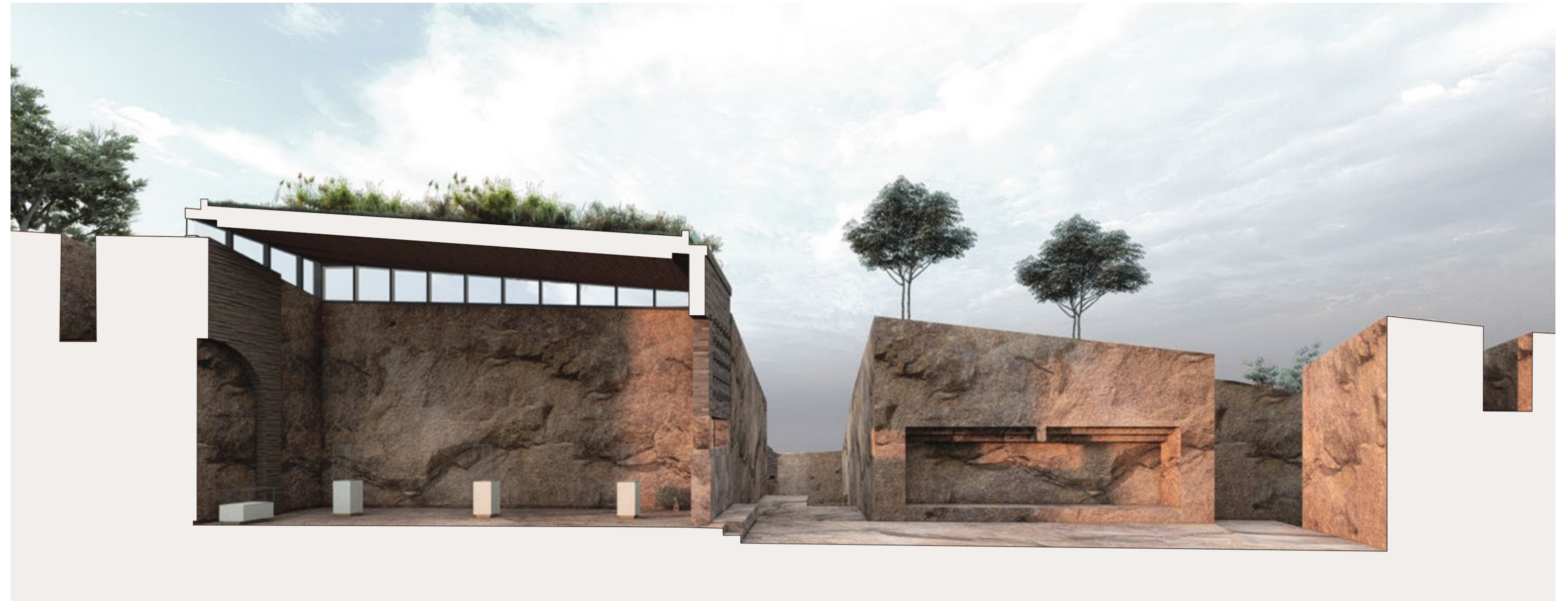
B2 perspective Section C-C 1:100

Areas where worshippers and travellers can collectively meet are just as essential as the intimate and more isolated moments. LIMES depicts a series of these in the form of courtyards as the larger open spaces frame the interior rooms.