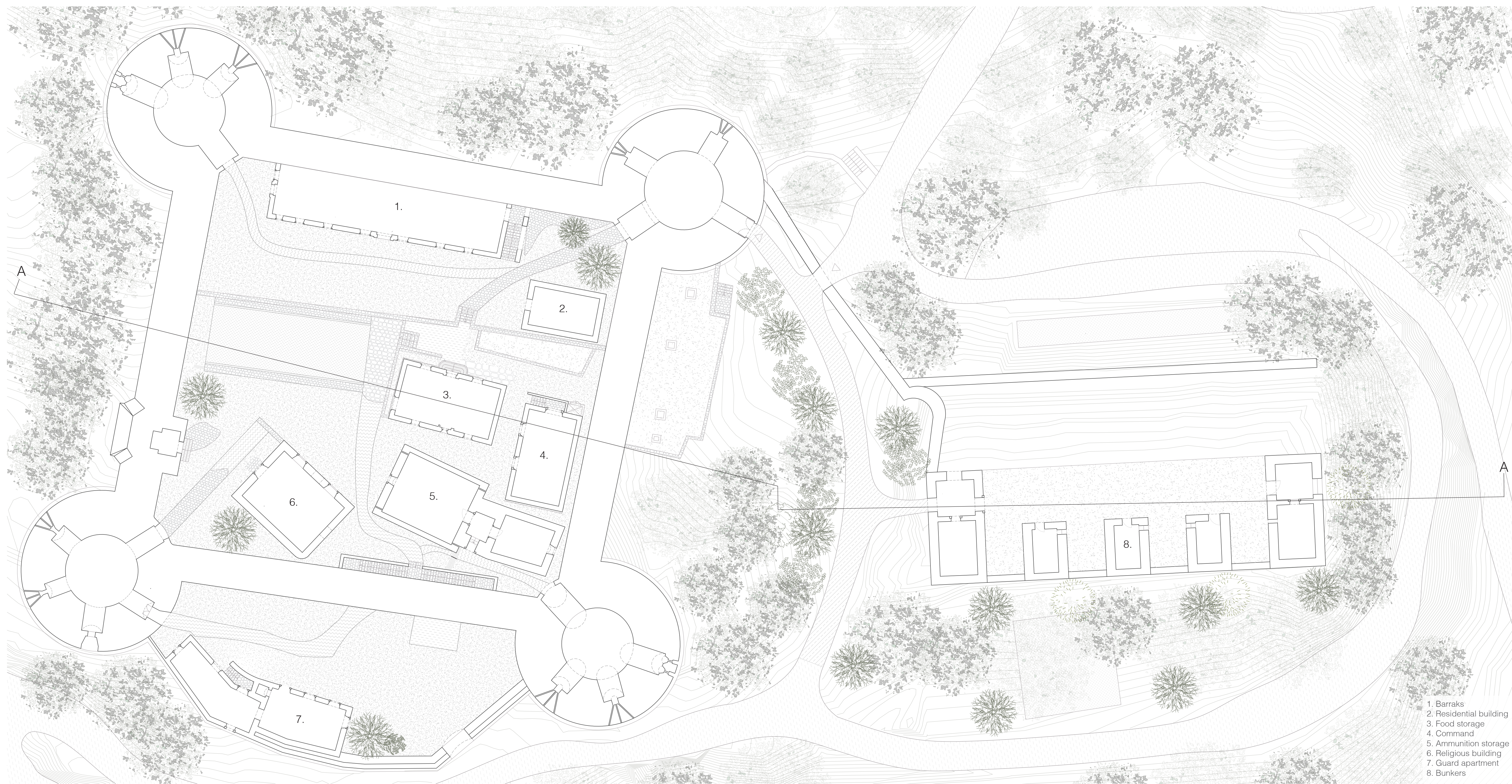
GROUND FLOOR PLAN (1:200)