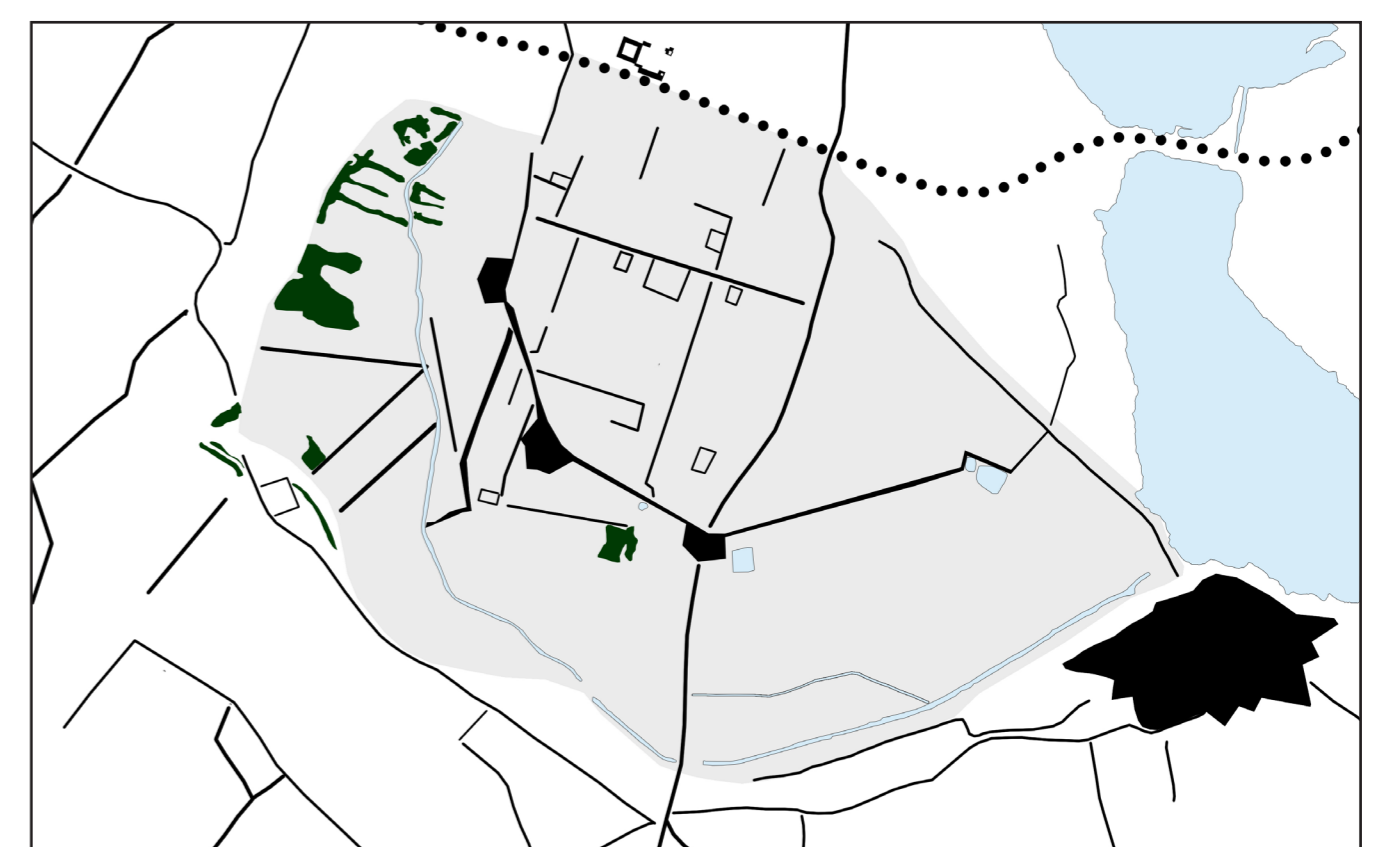
+ Roads and Field Lines-Paths