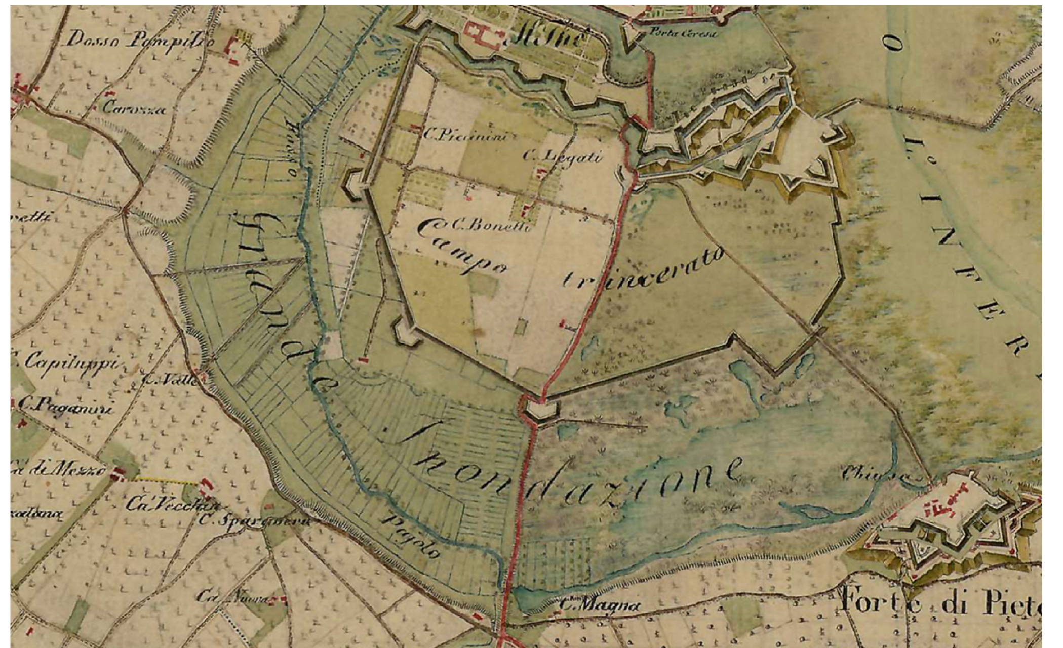
Mantova and Surroundings: Austrian State Archive, 19th Century