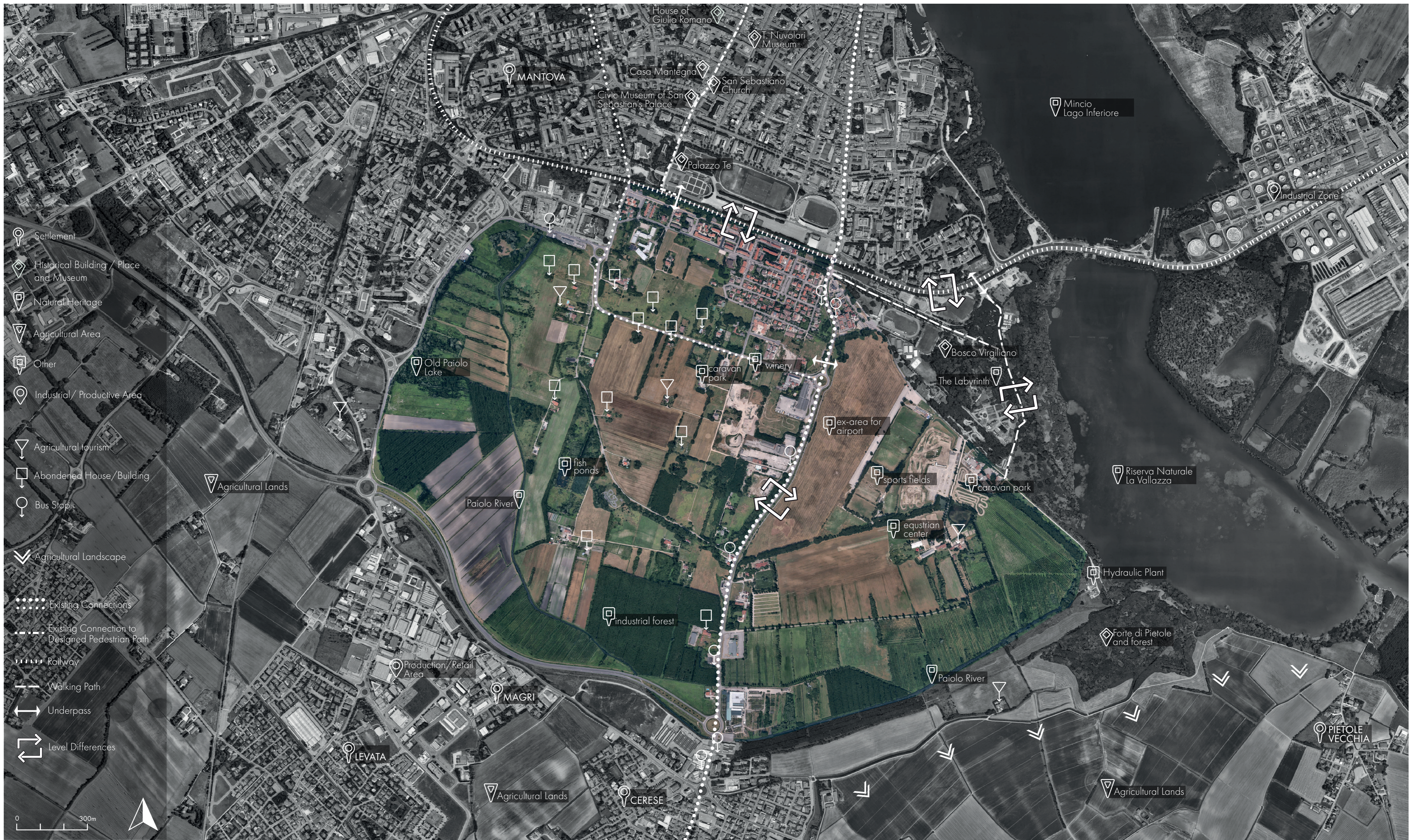
Existing Point and Linear Elements on the Site and Surroundings