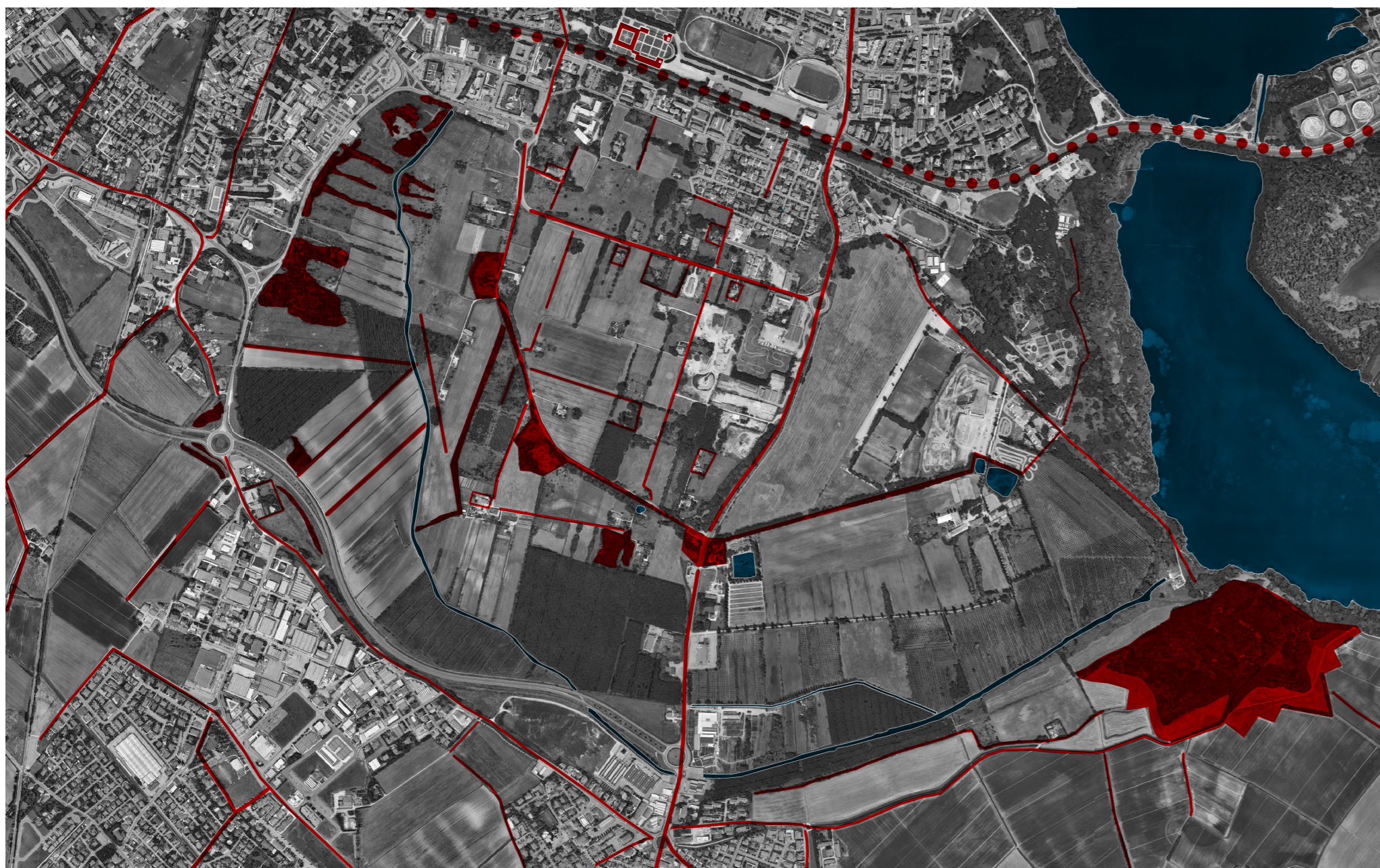
Matching Traces: Existing situation matched with 19th century map

The reason for choosing this area as a site is that it is in a position to meet the growth need of the city in line with the criteria of urban age and that it will provide an interesting base for the natural and historical elements it has and the way their traces treat the area.