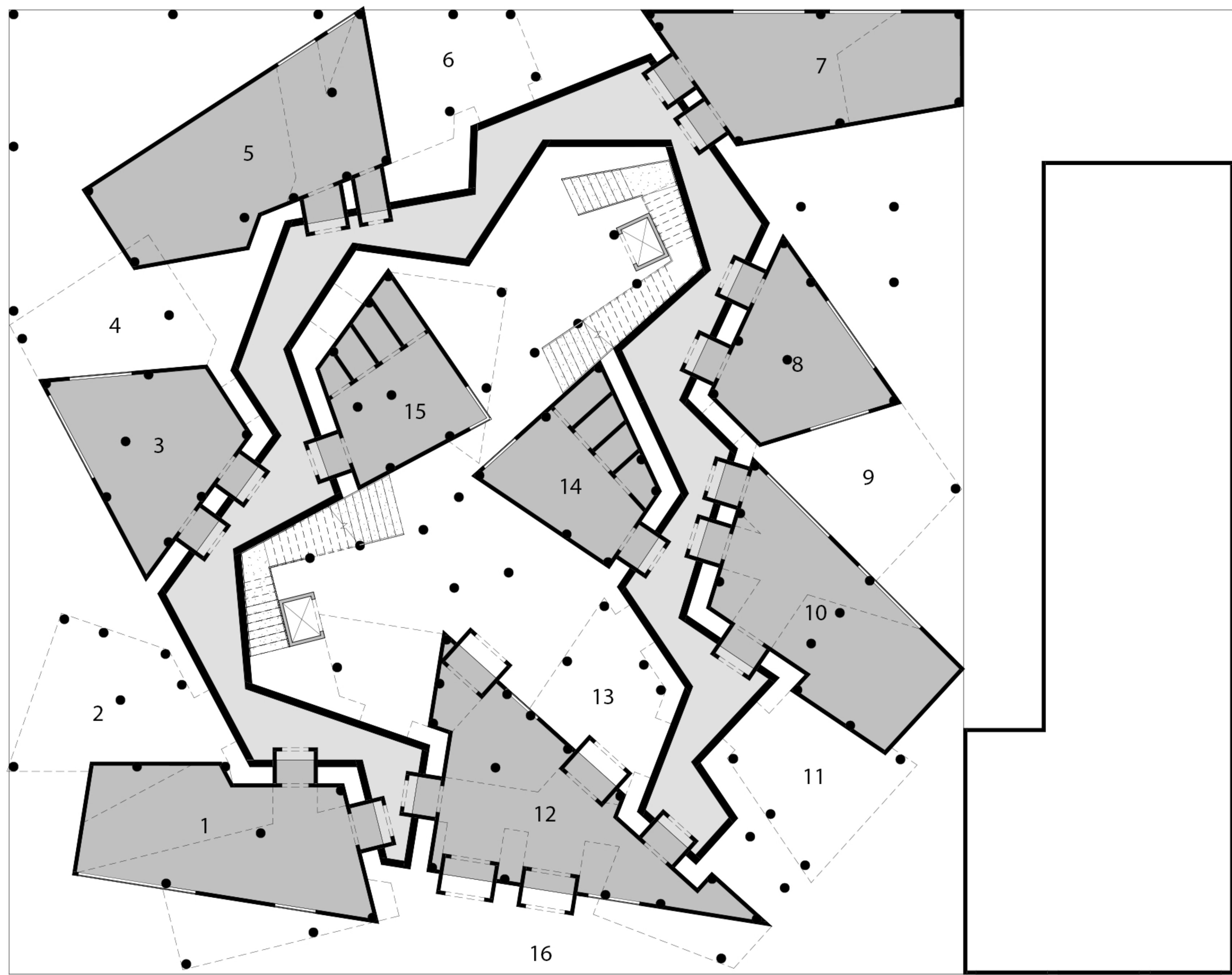
Ground Floor Plan 1:100