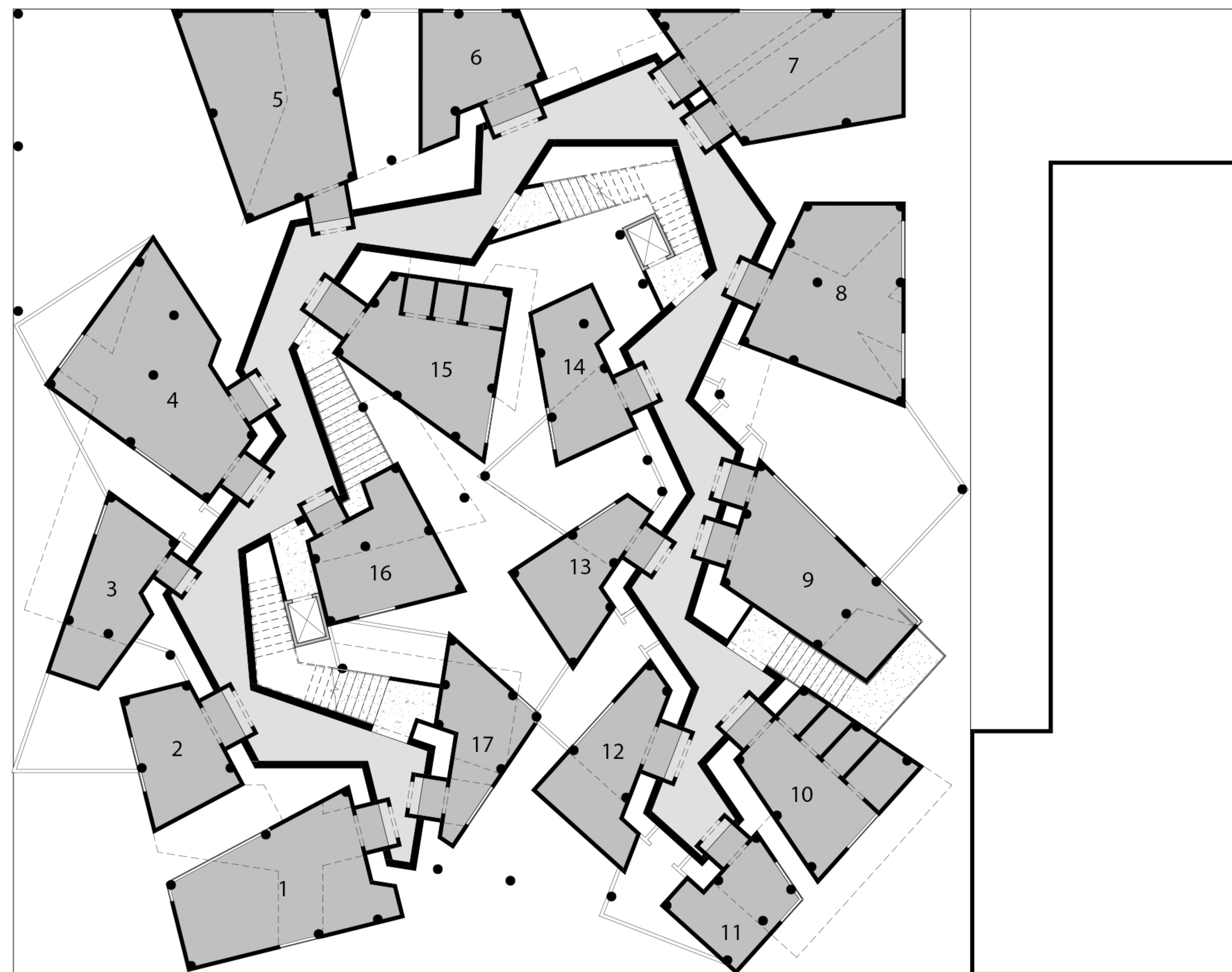
Second Floor Plan 1:100