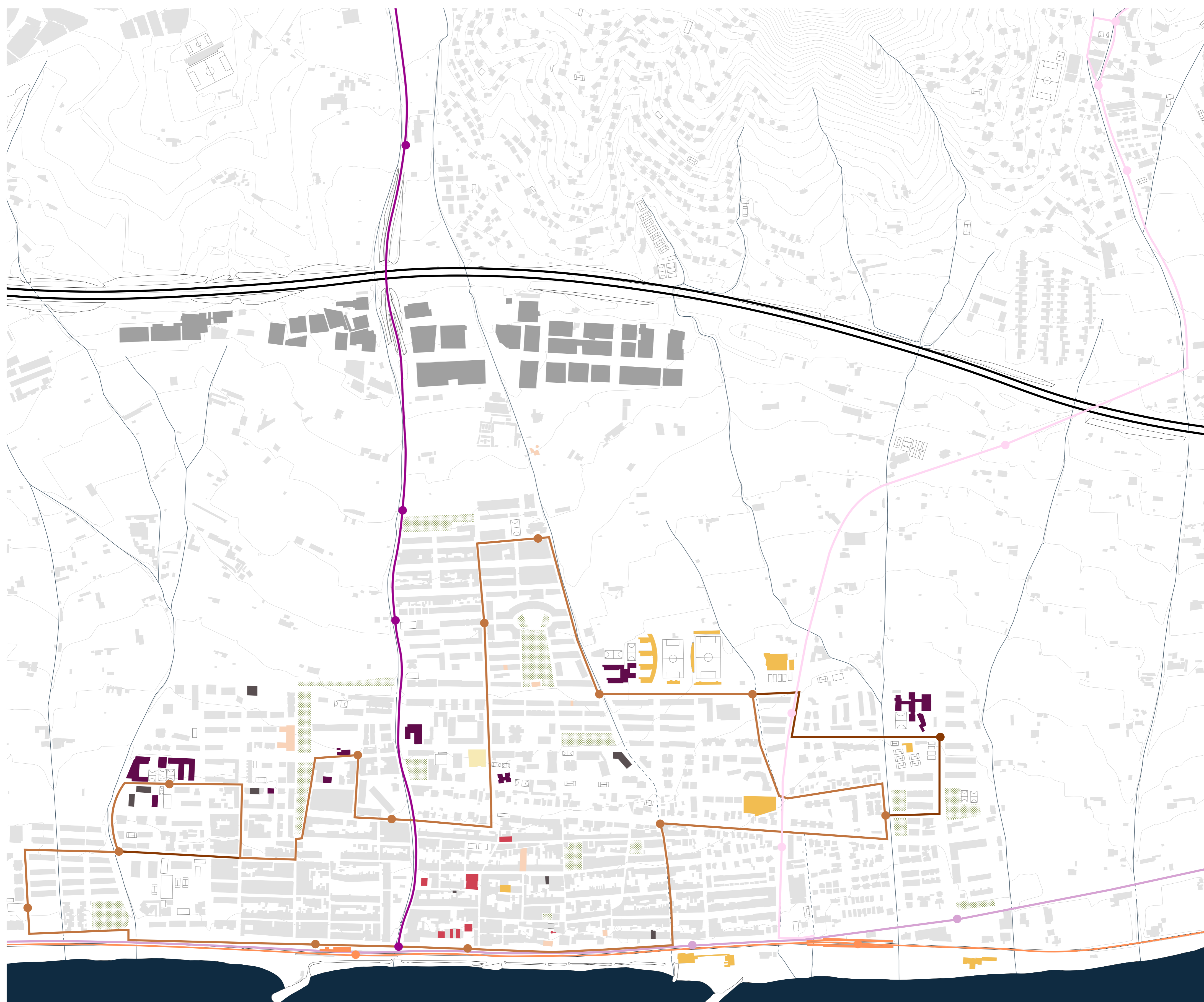
2. Vilassar de Mar rail transport coverage