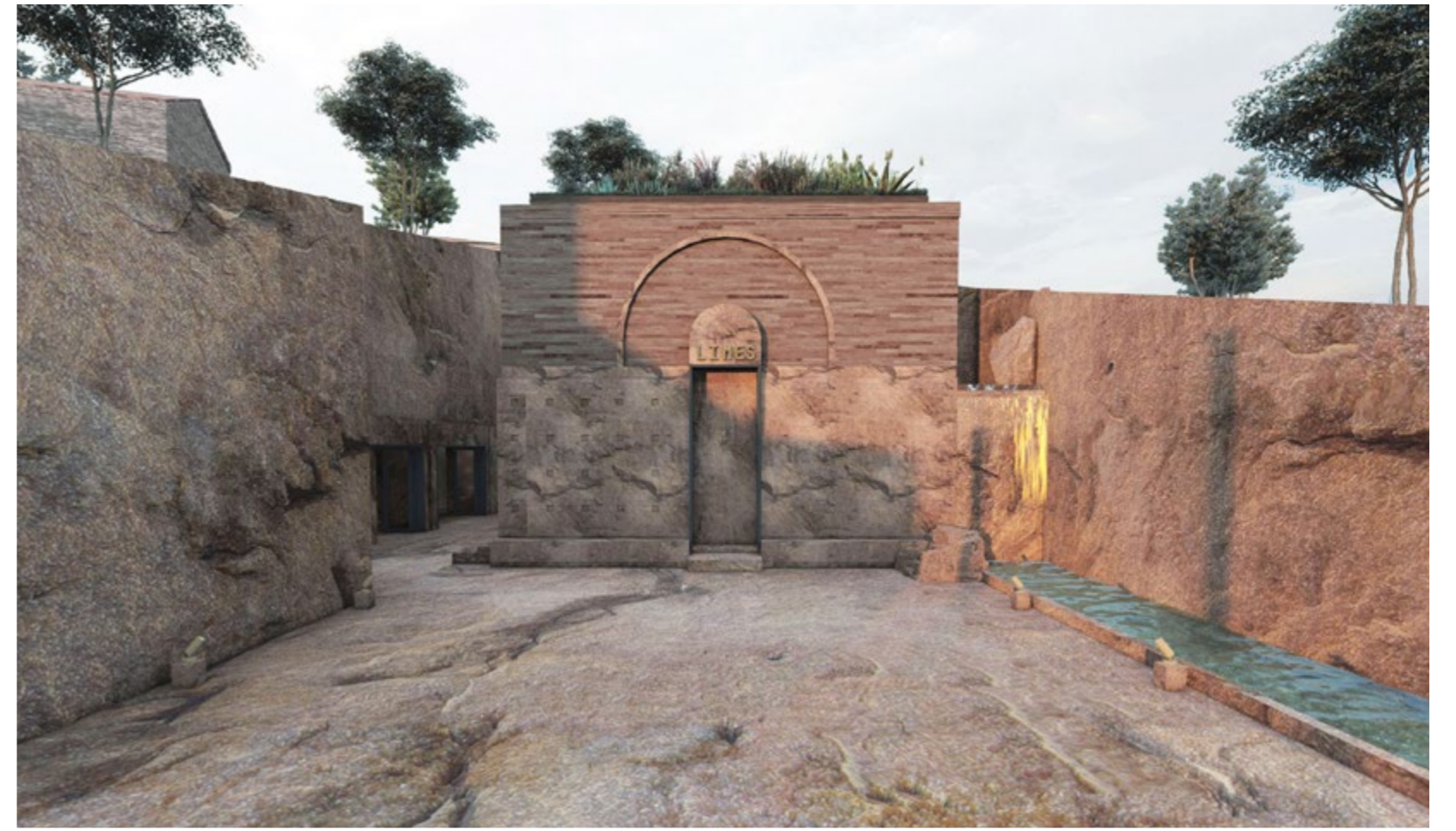
B1 Perspective elevation