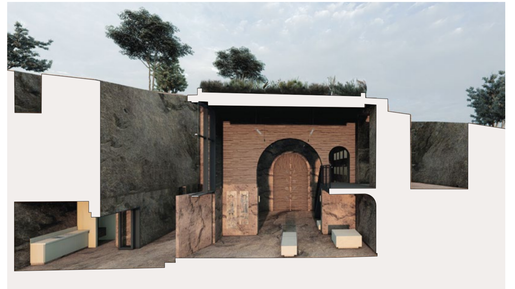
Interior perspective short section A-A 1:100