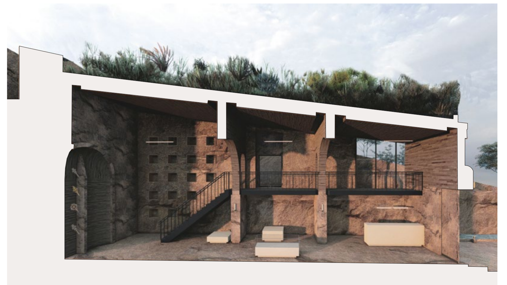
Long perspective section B-B 1:100