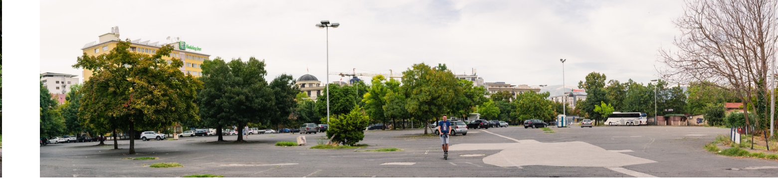
View 5 from parking entrance on south side of block, September 2021

Photo montage of the current reality of the urban block C08