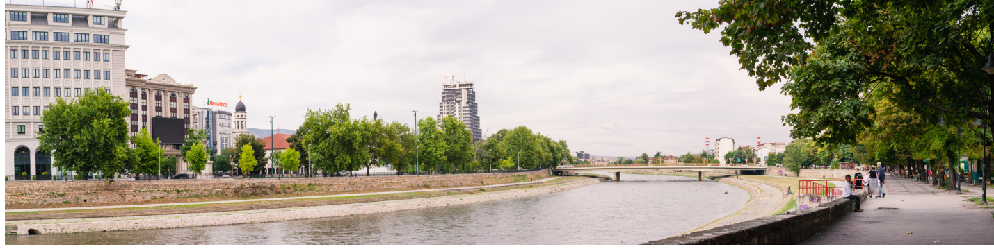
View 4 from the right bank towards Vardar riverfront and city on the left bank, September 2021