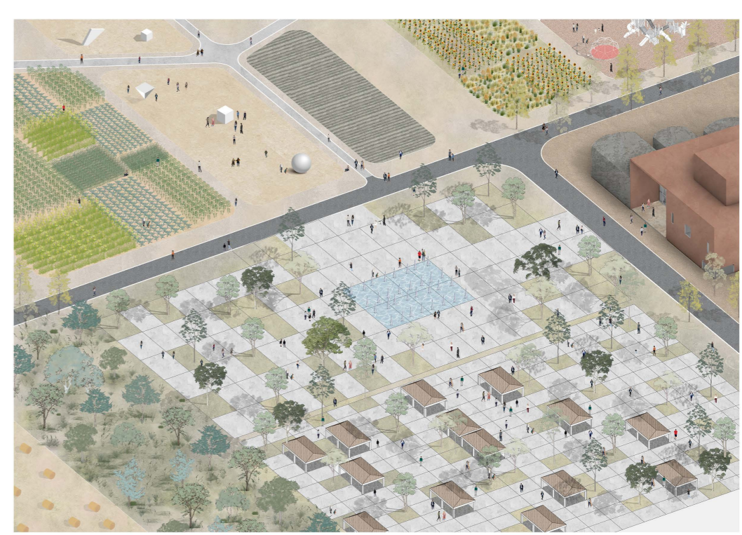
2 (REFER TO KEY MAP) The Northern part of the paper mill will be a plaza and a farmers market that together creates a vibrant environment. The pavement is a reclamation of an existing concrete pattern.