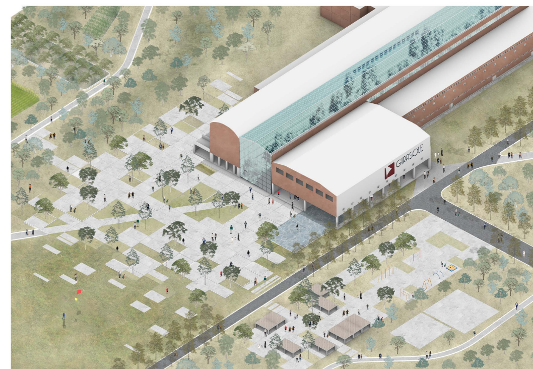
3 (REFER TO KEY MAP) A passage guides the tourists and city dwellers from the southern entrance toward a new public open space that creates a center for the park.