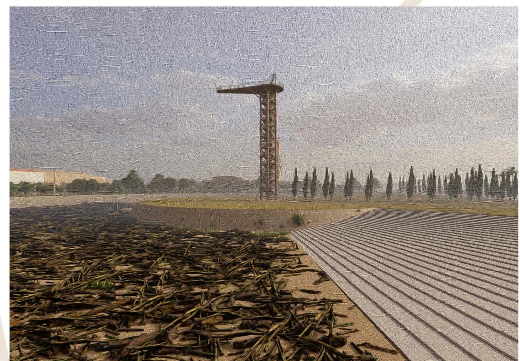
1 (REFER TO KEY MAP) The area of the former stacker and the crane is now a watch tower and a place for different activities. From a platform for festivals to an exhibition space for trees collected from forest and park cleaning