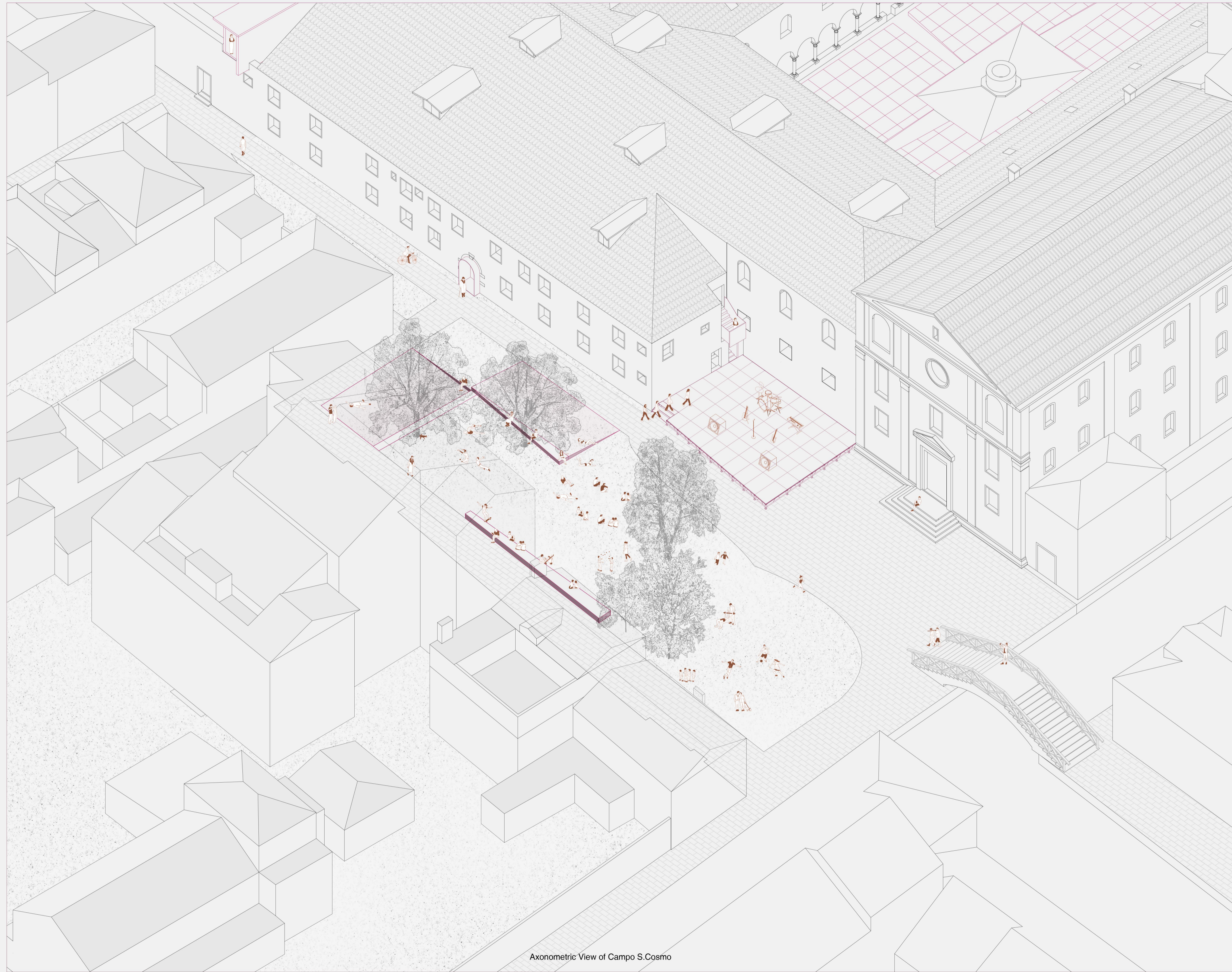
A Vivid Event Site: Campo S.Cosmo