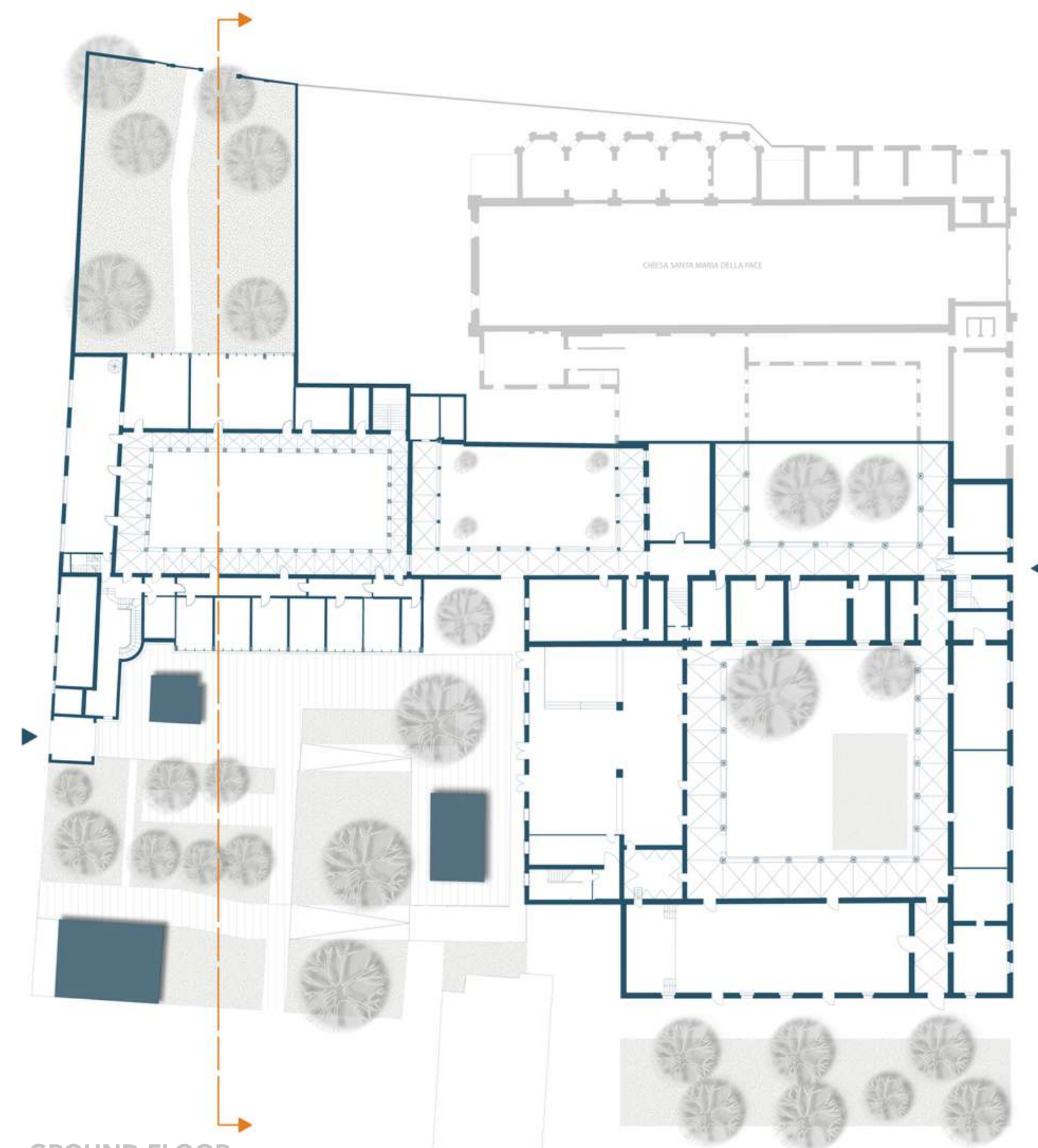
GROUND FLOOR 1/500