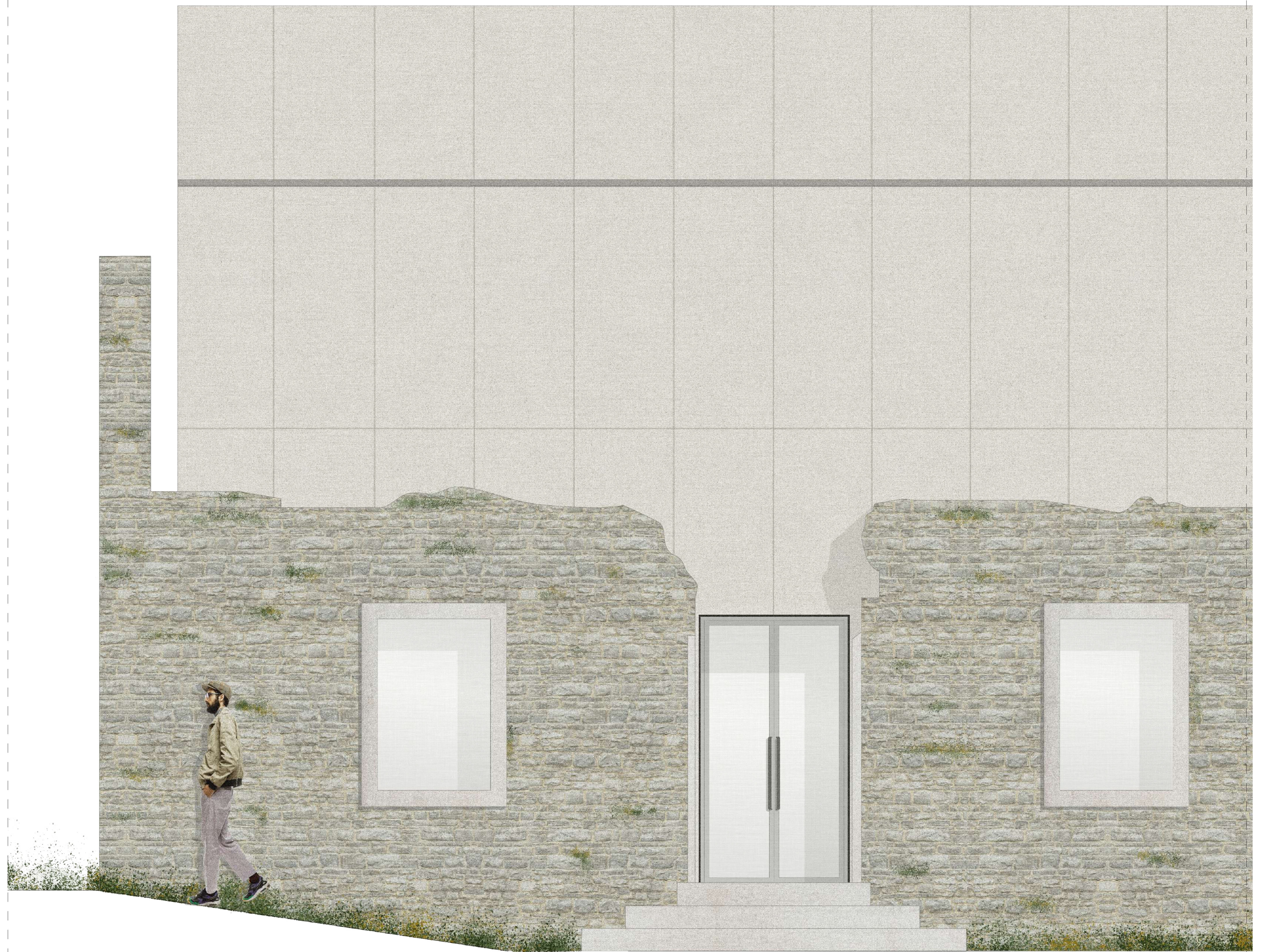
FACADE ELEVATION DETAIL SCALE 1:20