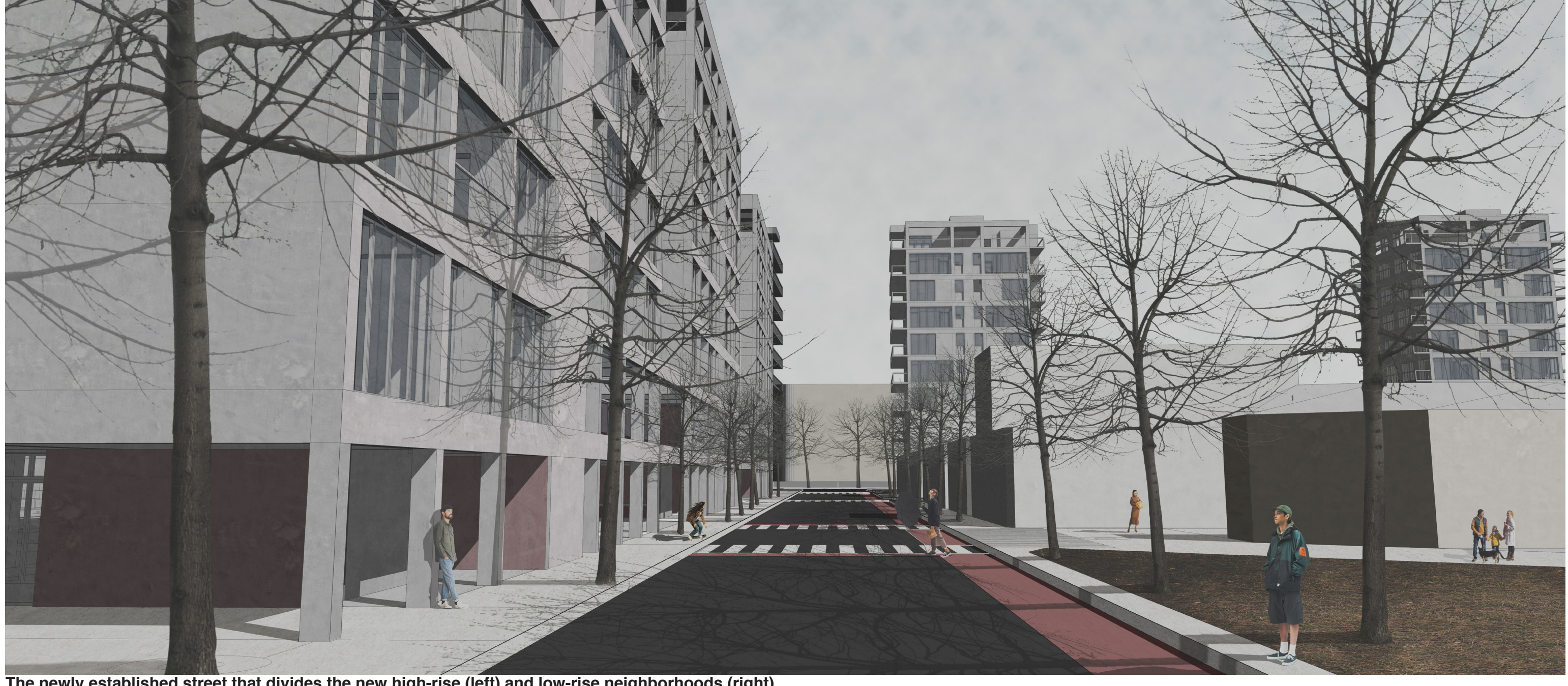
The newly established street that divides the new high-rise (left) and low-rise neighborhoods (right)