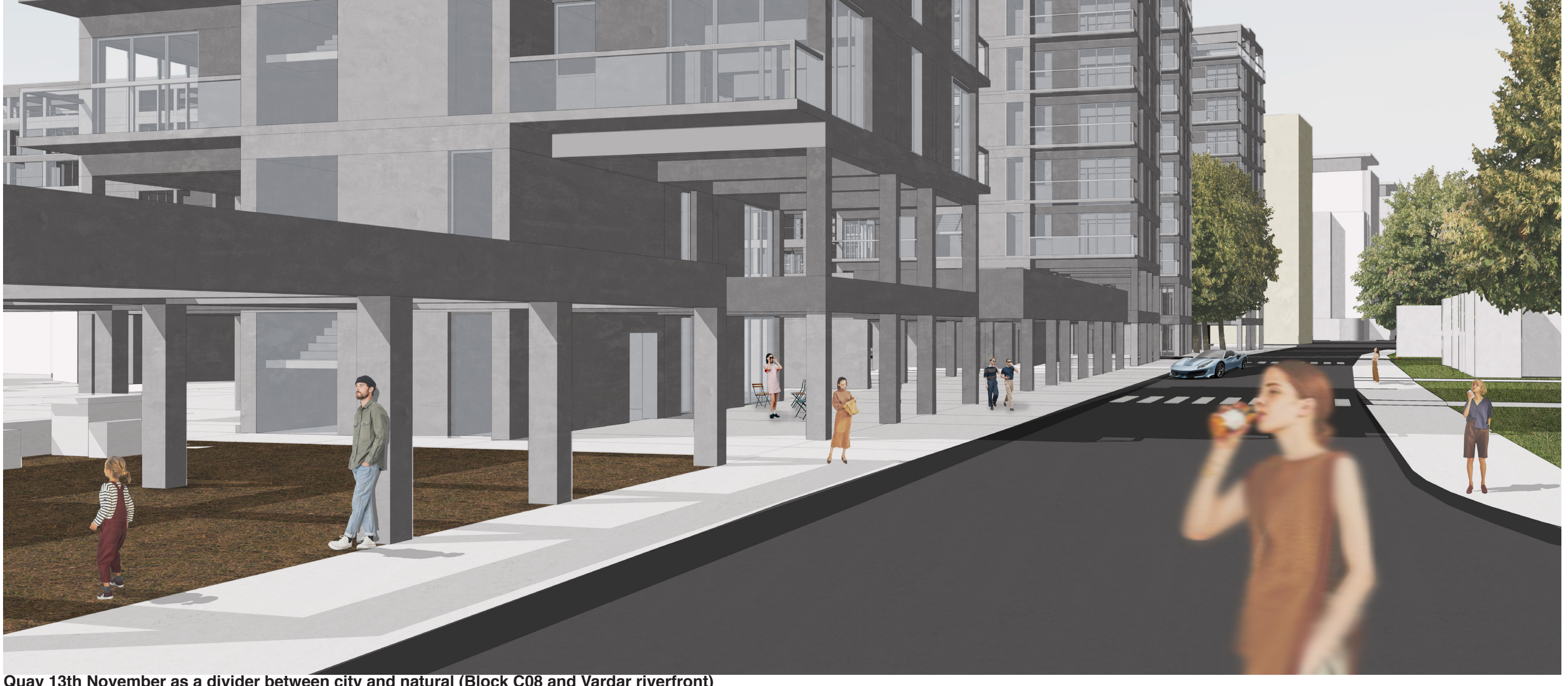
Quay 13th November as a divider between city and natural (Block C08 and Vardar riverfront)