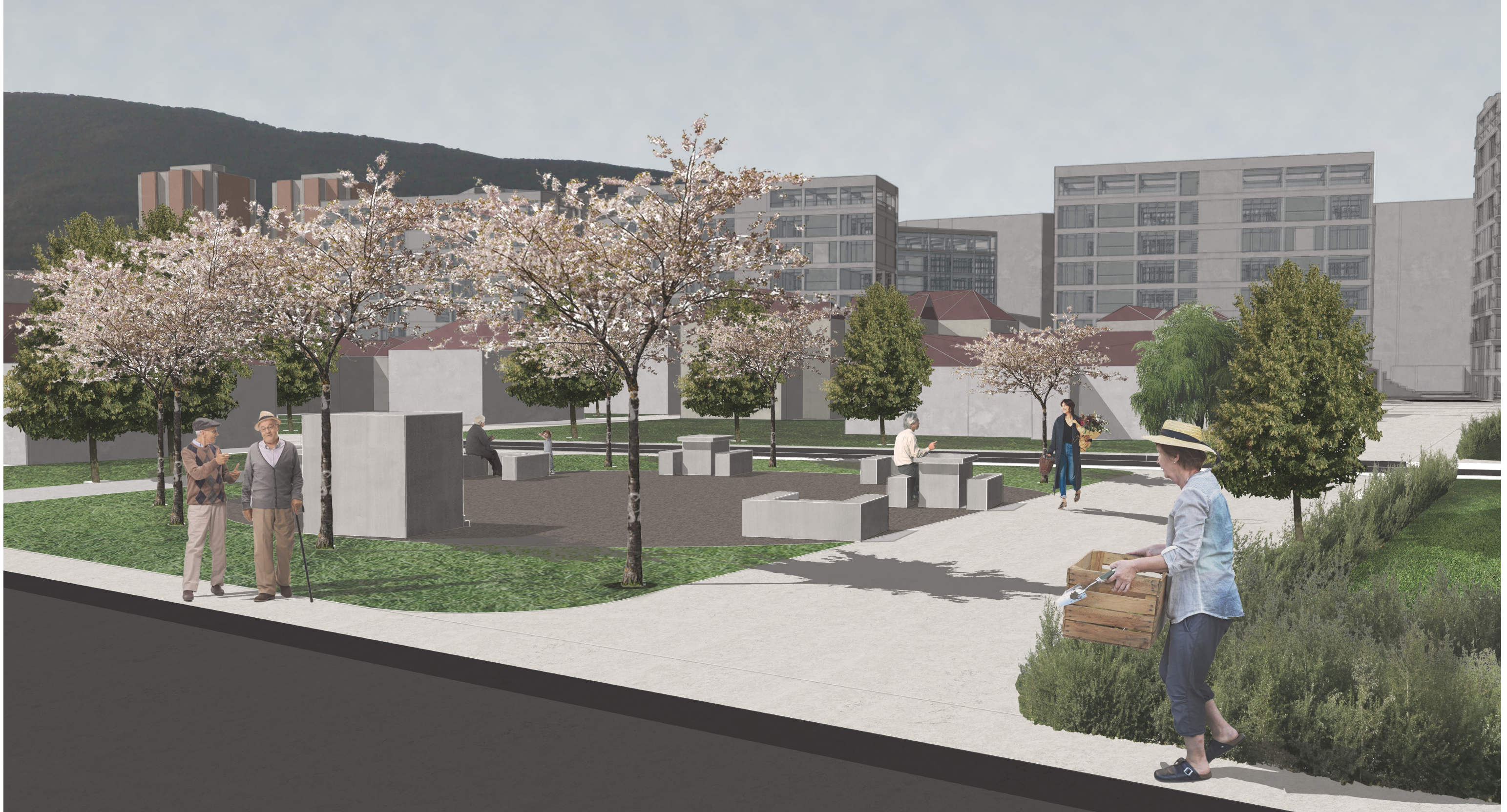
Novo Maalo 'courtyard' - a slow pace environment for grouping of the current residents