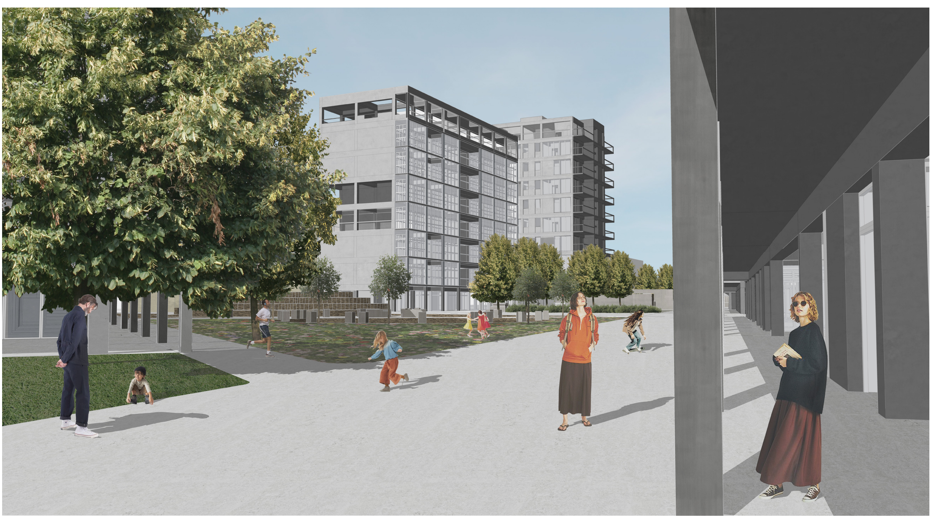
City Wall reimaged 'courtyard' - a fast paced park for all ages, but predominantly the local youth