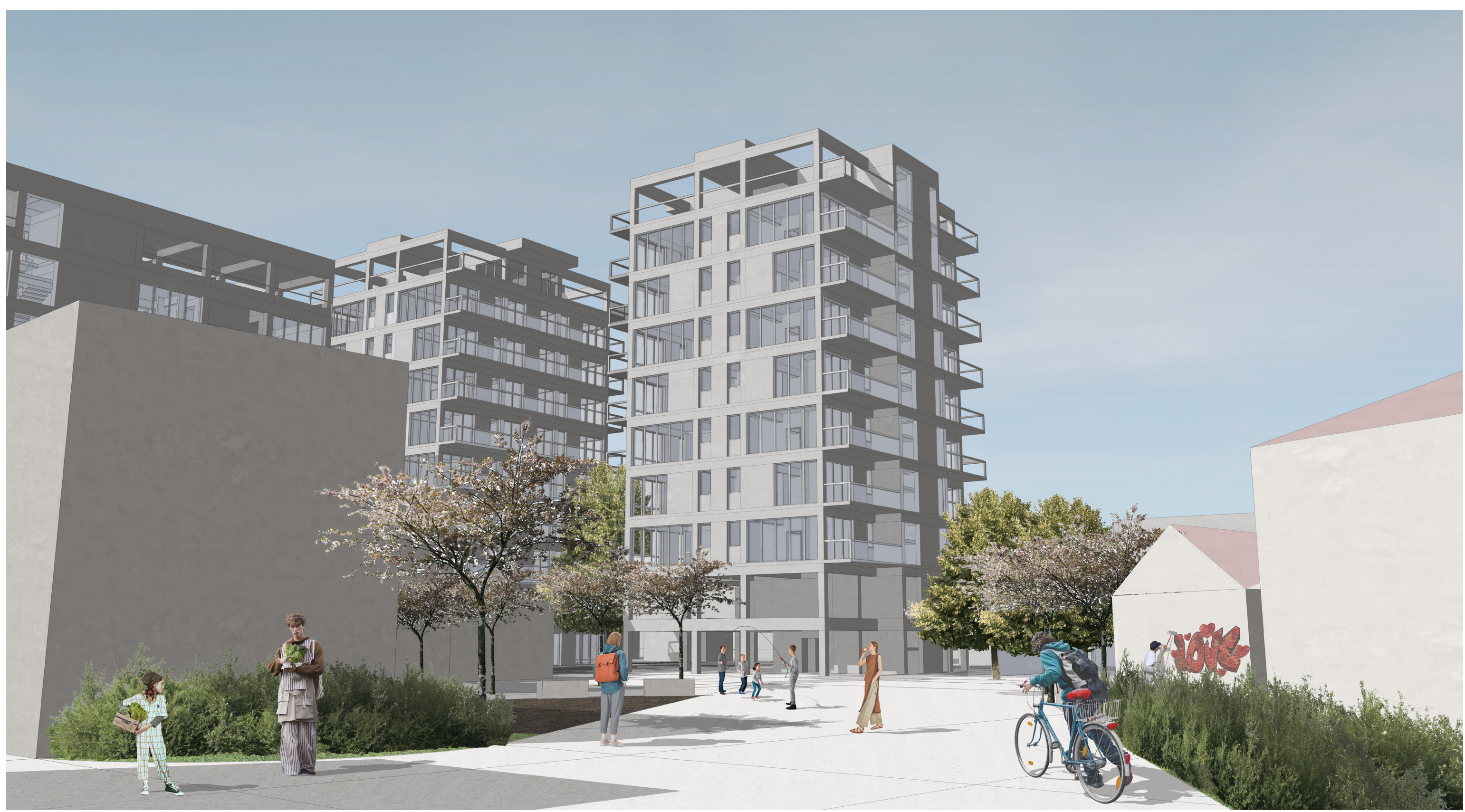
Novo Novo Maalo 'courtyard' - a meeting place for old and new residents focusing on active community participation