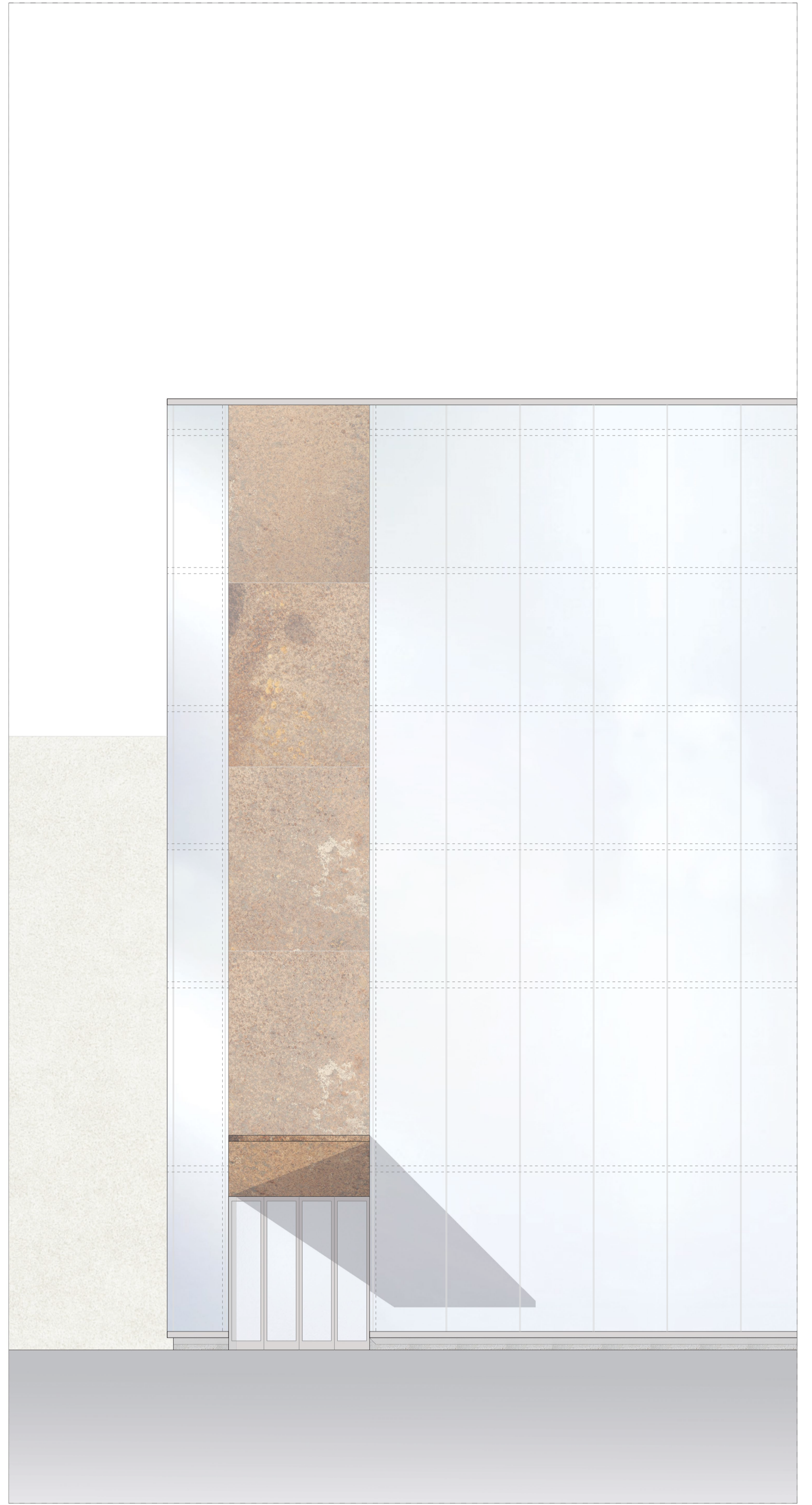
ENTRANCE ELEVATION 1:50