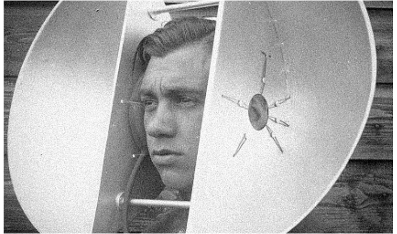
1/ hearing loss warfare acoustic mirror

Today buzzy and noise-polluted Lodi-Corvetto mile was recently the part of a completely different landscape - it was surrounded by wide fields and agricultural lands. Redefossi channel was not yet intubated and took its journey right along the Corso Lodi. Now these environments are lost. The project evokes these forgotten areas using sound as the main explorer between locations and as a design tool for collective experience. Ears of Corvetto concept presents a sequence of public spaces for the local communities, made in the principles of 15 minutes city. Each space is focused on enhancing some particular kind of sounding, creating an augmented sound reality.