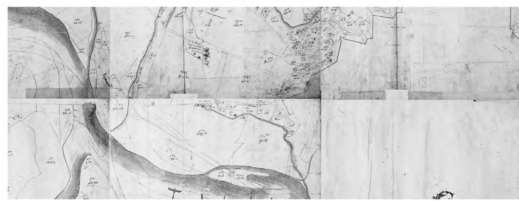
CESSATO CATASTO - 1722/1856