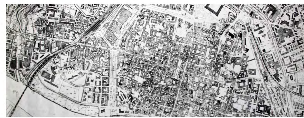
AERIAL PHOTOGRAMMETRIC SURVEY - 1954