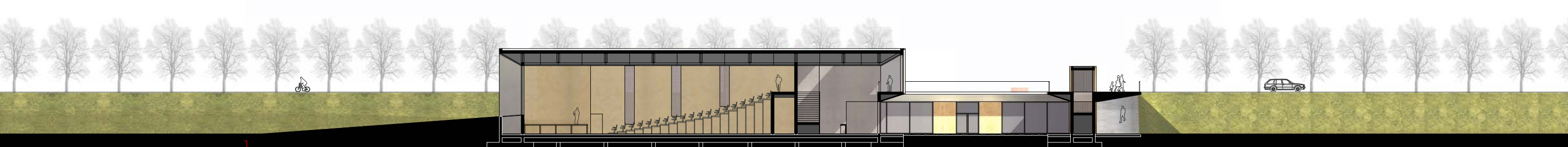
sezione auditorium C-C' 1 : 200