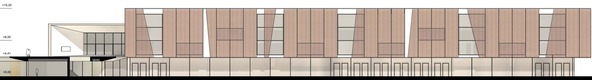
prospetto ovest 1 : 200