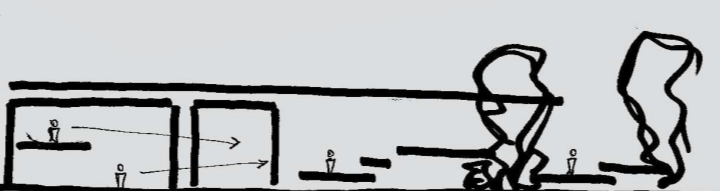
Sketch of literary cafe