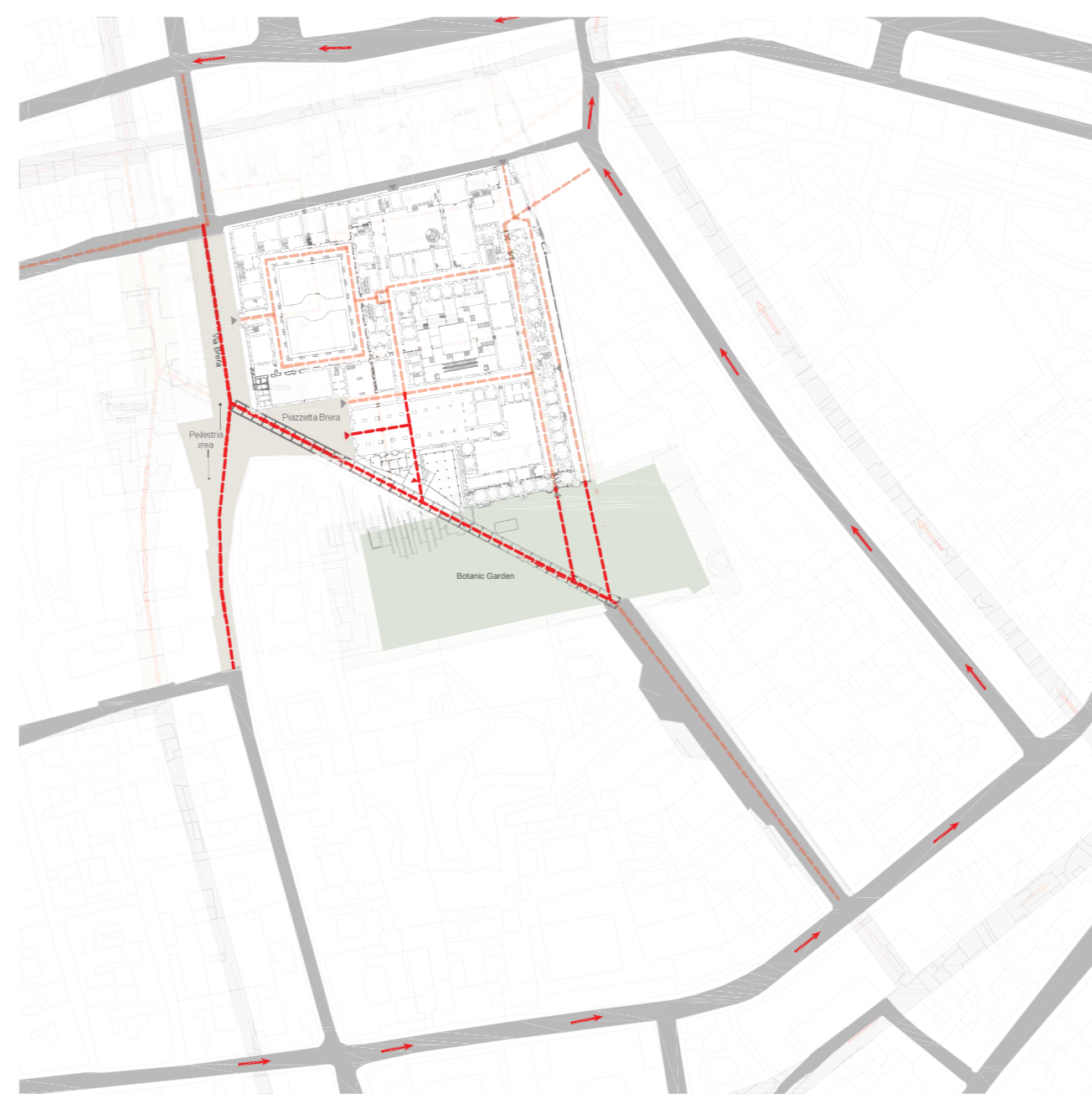
"Network of itineraries" proposed by project

The idea of permeability In present days LARGE UTILITIES are not only used but lived daily and they have a STRICT RELATIONSHIP with the CITY . According to the scale of the building and the SURROUNDING URBAN FABRIC this relationship also changes the way of CONNECTION to the city especially to the SETTLEMENTS . These facts show the IMPORTANCE of the connection to the URBAN TRANSPORTATION , various URBAN SERVICES , crowd and also the architecture of the building itself. In this PROJECT , according to the larger scale study, an important PROBLEM is ACCESSIBILITY through the complex to the surrounding spaces which emerge through