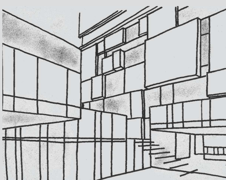
perspective sketch of the platforms and the facade