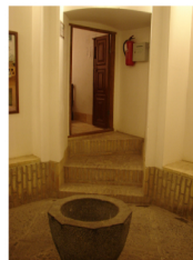
Hotel Laleh (Sardar), Yazd