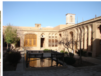
Khaneh Lariha (Andaruni), Yazd