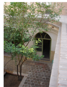
Architecture Faculty (Godal Bghcheh), Yazd