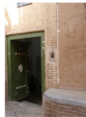
Architecture Faculty (Sardar), Yazd