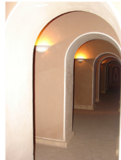
Hotel Laleh (Service areas), Yazd