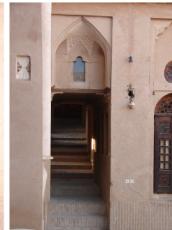
Khaneh Lariha (Service areas), Yazd