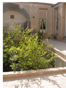
Architecture Faculty (Godal Bghcheh), Yazd