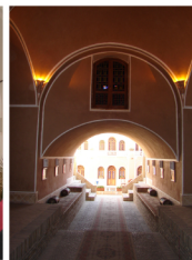
Hotel Karvansehay Moshir (Sardar) Yazd