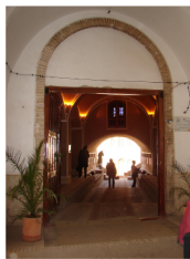
Hotel Karvansehay Moshir (Sardar) Yazd

these places were never located on the main axis.