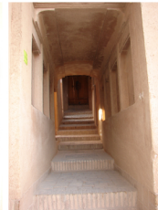
Khaneh Lariha (Service areas), Yazd