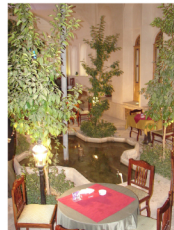
Hotel Laleh (Andaruni), Yazd