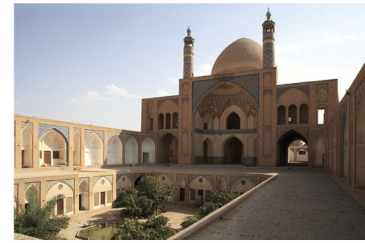
Agha Bozorg Mosque (Godal Bghcheh), Kashan