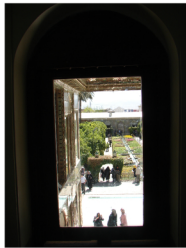
2.Ghavam Orangery (fruit garden)

3.state garden these were mostly fortifi- cations in the city and since hey had big gardens within them they could be considered as state gardens