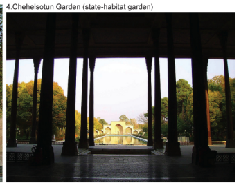
4.Chehelsotun Garden (state-habitat garden)