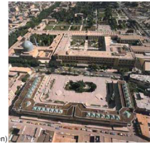
5.Chahar Bagh (river side garden)