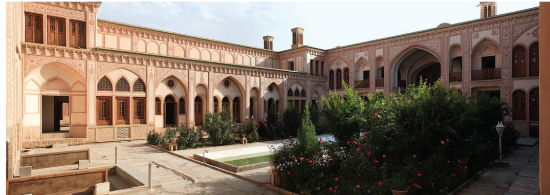
Ameriha House, Kashan