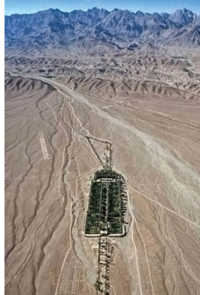
Shahzadeh Garden ,Kerman