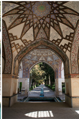
Fin Garden, Kashan