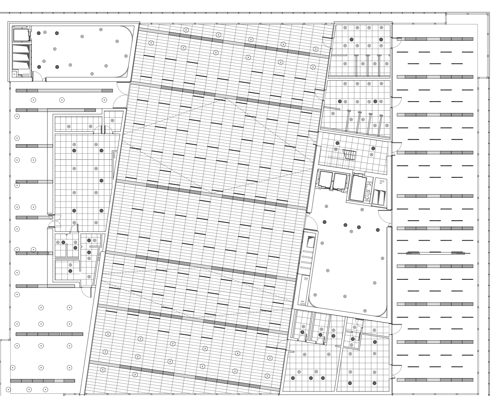
Corrosolito piano secondo