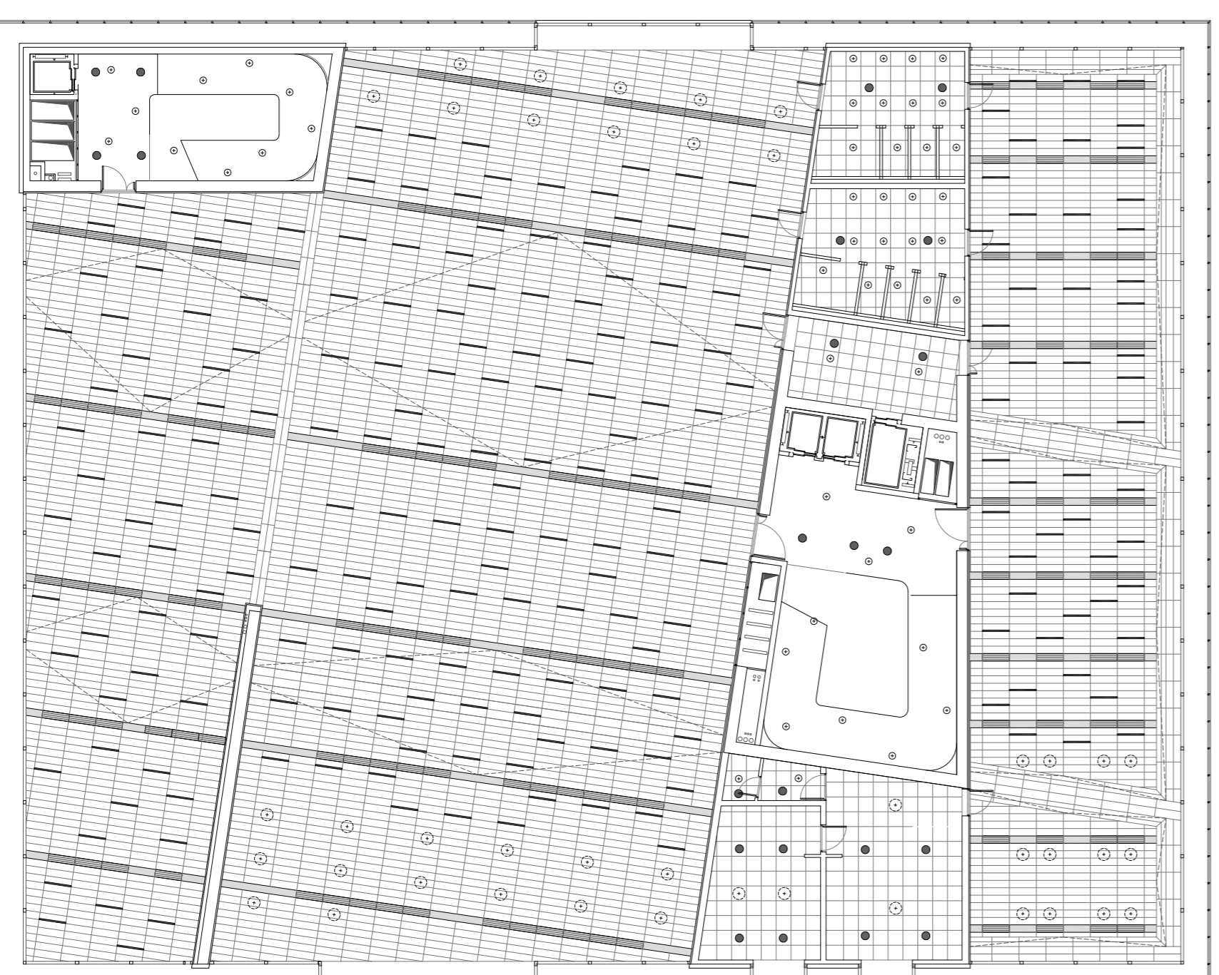
Corrosolito piano primo