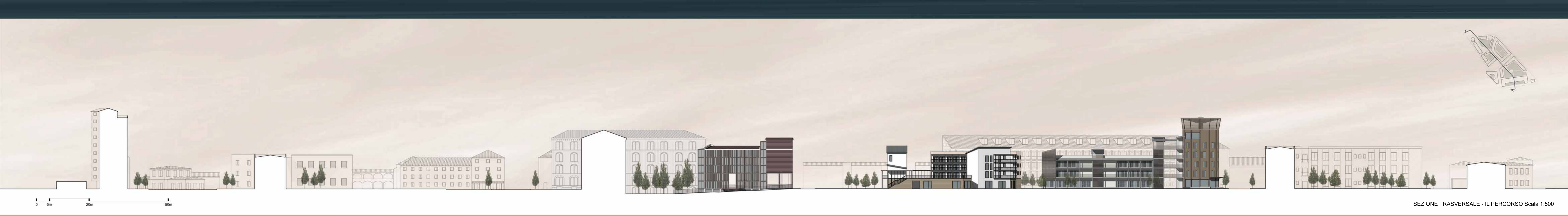
SEZIONE TRASVERSALE - IL PERCORSO Scala 1:500