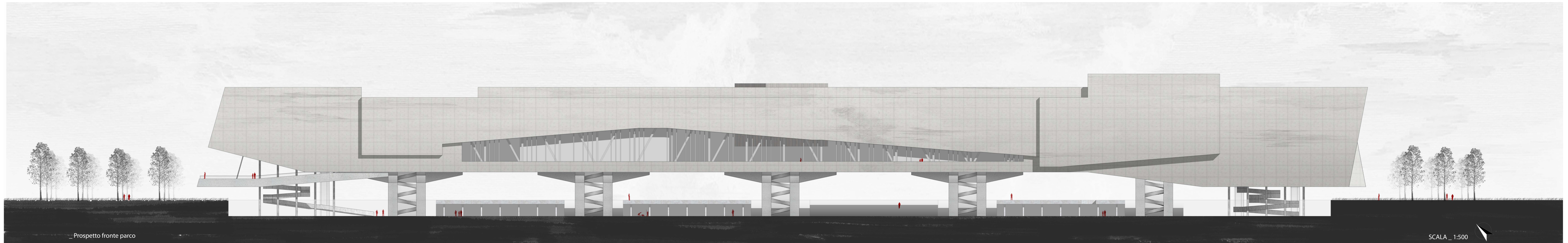
_ Prospetto fronte parco