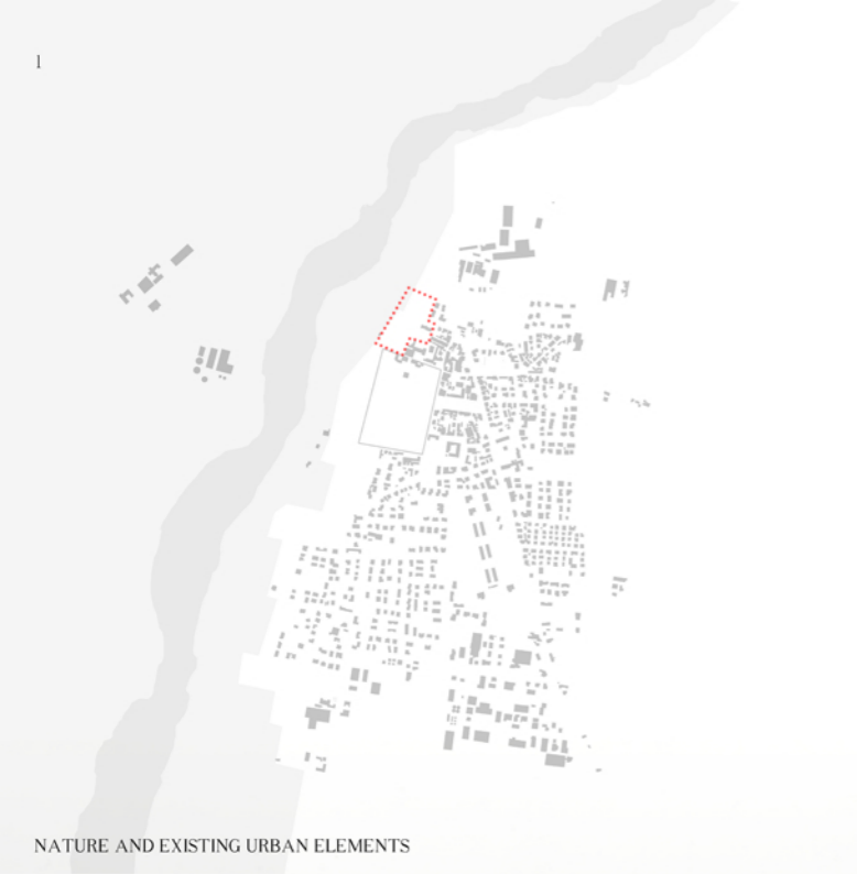
NATURE AND EXISTING URBAN ELEMENTS