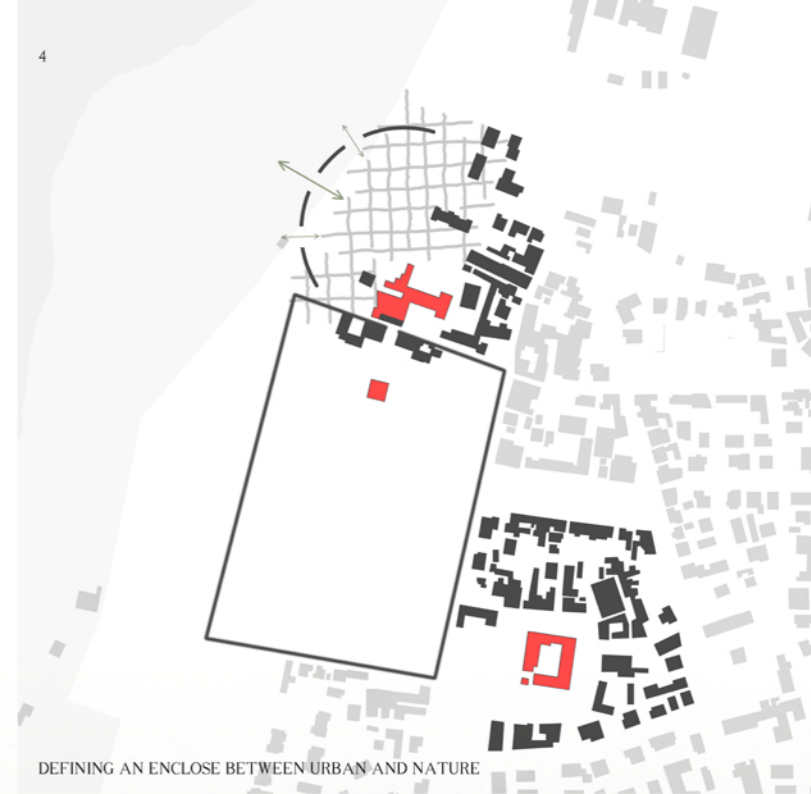
DEFINING AN ENCLOSE BETWEEN URBAN AND NATURE

Town and country must be clearly delineated from each other to have a functional identity. This happened naturally for ancient and medieval towns that needed a wall or body of water to defend themselves. The sense of enclosure is also important to the individual places within a town.