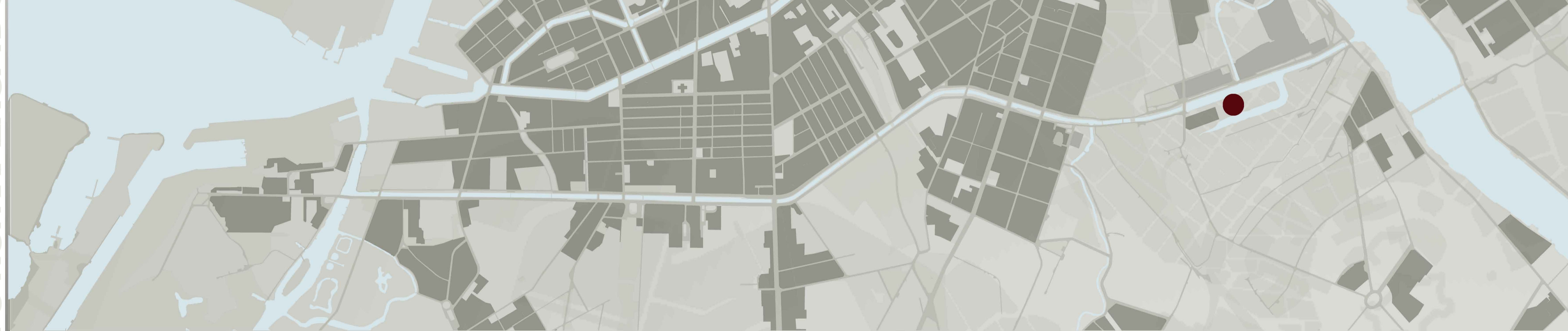
Obvodny channel studies: Open space. Environmental system 1:20000 / Обводный канал: структура окружающей среды