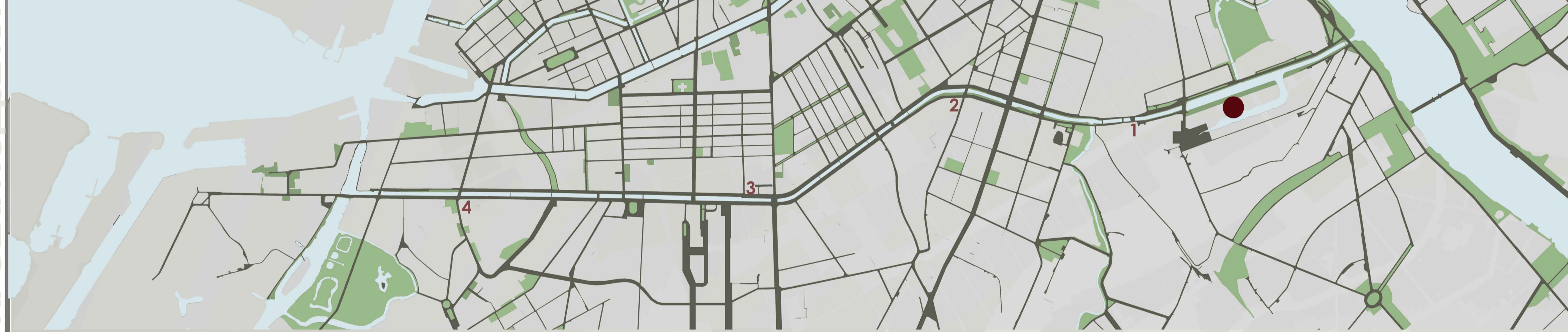
Obvodny channel studies: Functional map (Government master plan) 1:20000 / Обводный канал: функциональное зонирование.