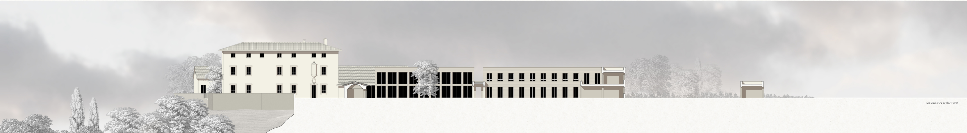
Sezione GG scala 1:200