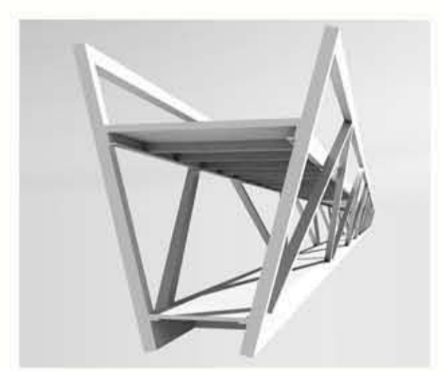
SCORCIO STRUTTURA DEL PONTE