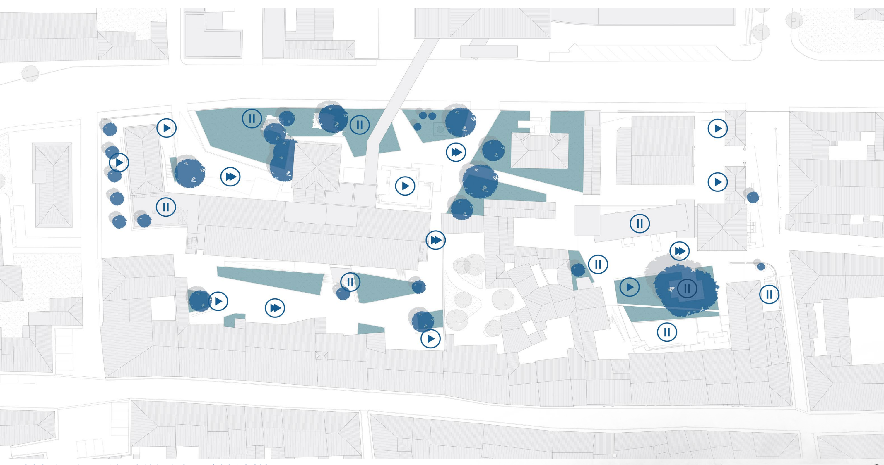
SOSTA - ATTRAVERSAMENTO - PASSAGGIO