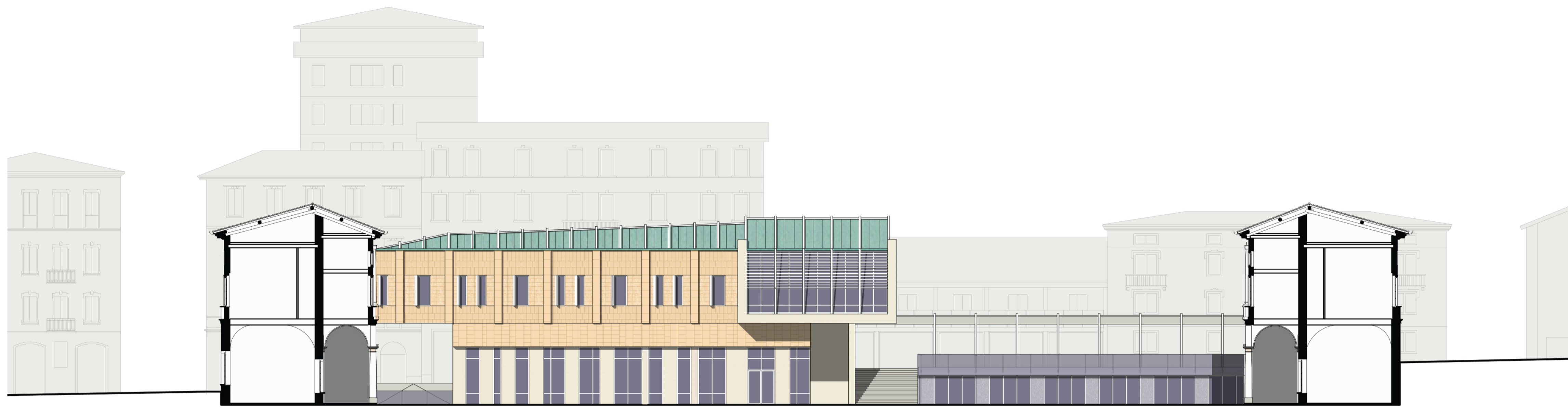
PROSPETTO SUD - OVEST _ 1:200