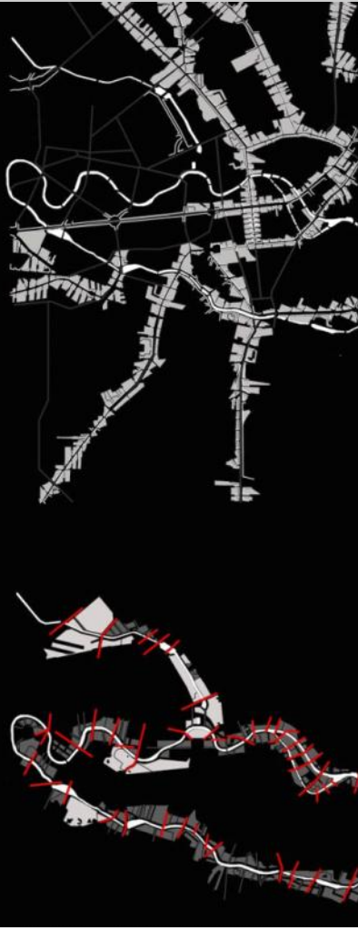
SYSTEM OF RIVER