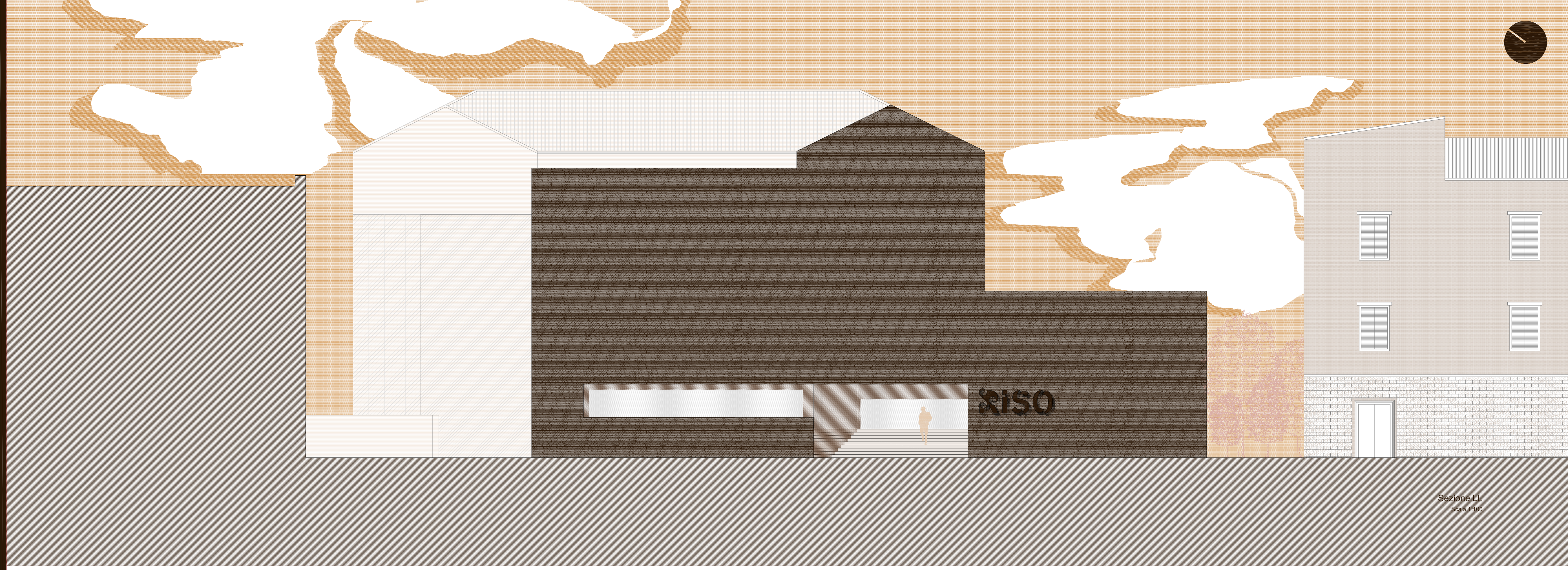
Sezione LL Scala 1:100