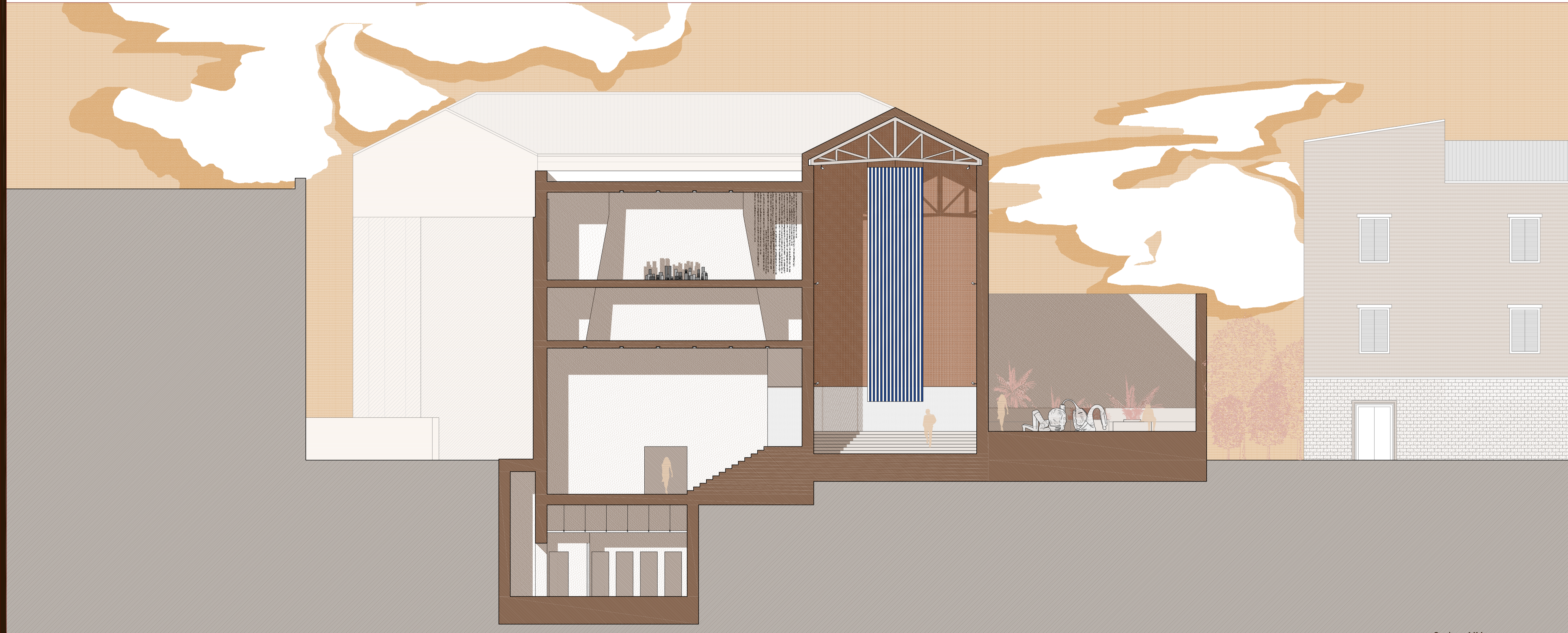
Sezione MM Scala 1:100