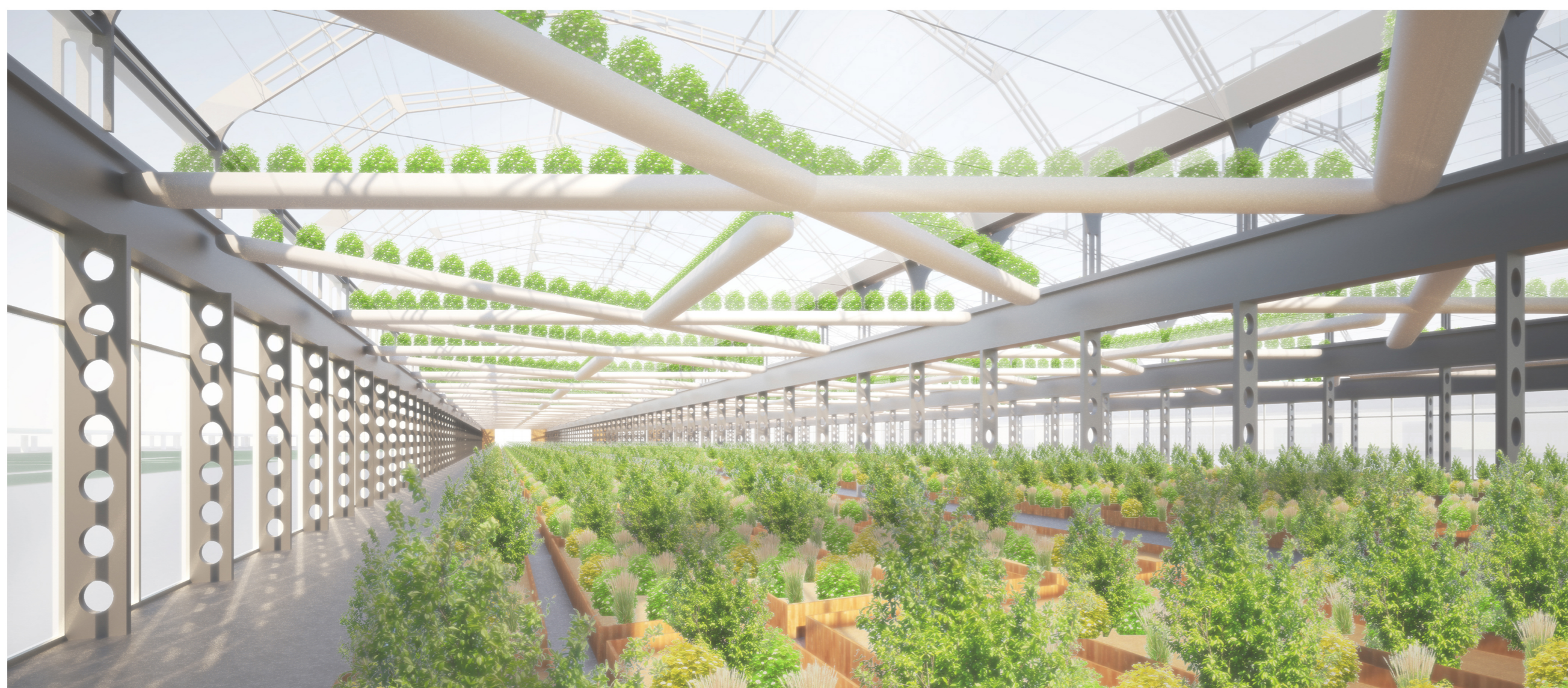
A 3D hypothetical visualization of the project's western wing