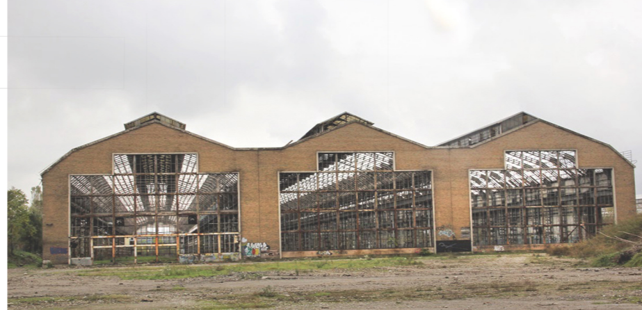
The Innse warehouses in their current state