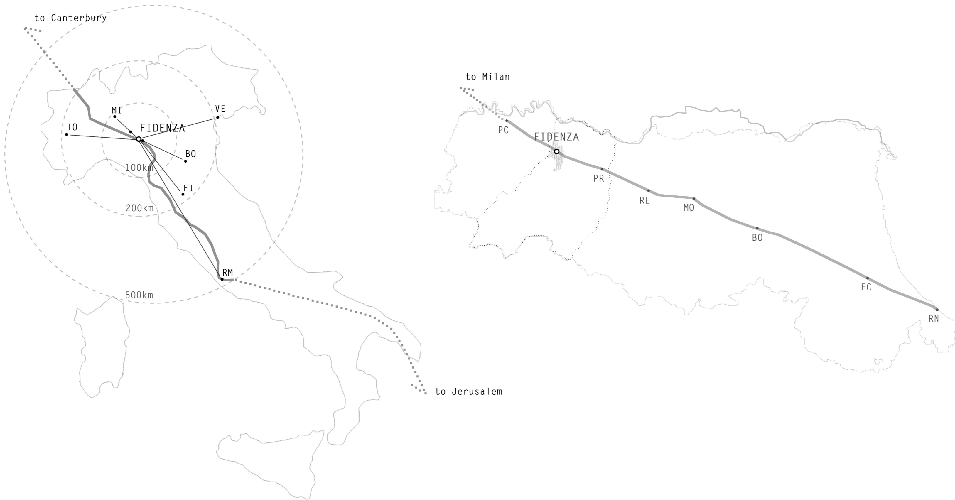
Emilia Romagna_Via Emilia

Fidenza, situated along the ancient Via Emilia, is among the smaller towns in the province of Parma where signs of life, culture and devotion of the Middle Age are still evident.