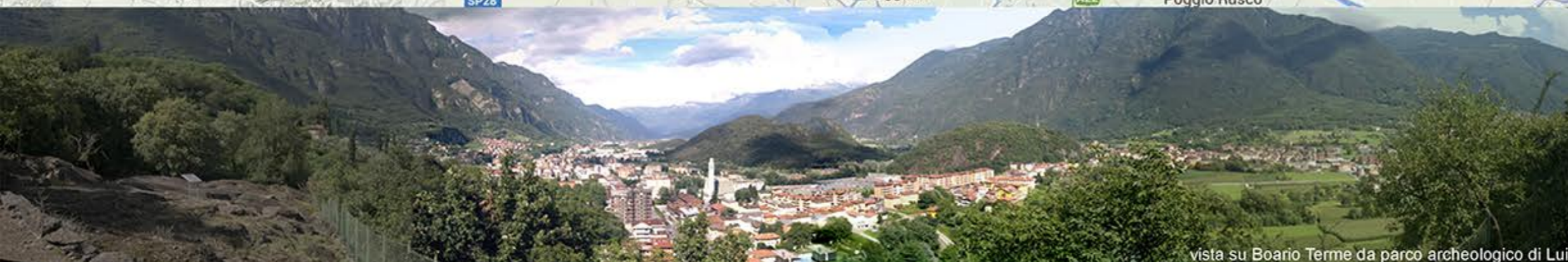
vista su Boario Terme da parco archeologico di Luine