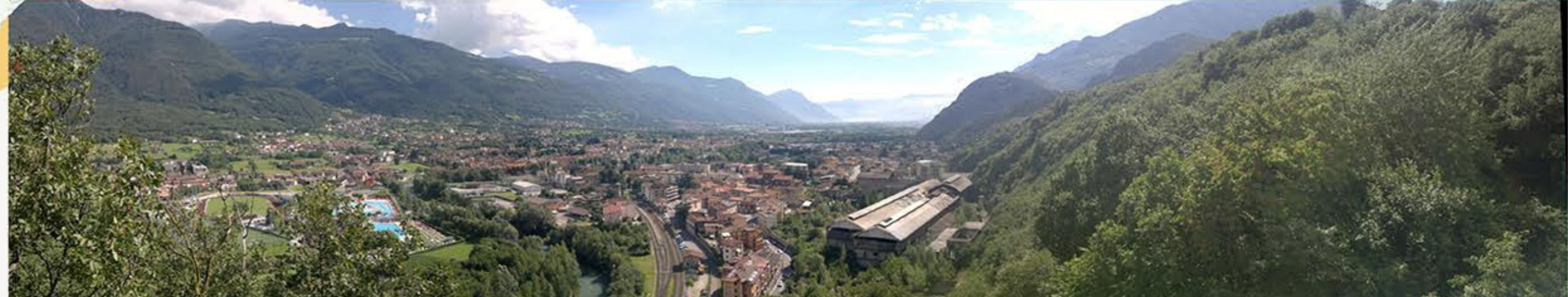
vista su Corna di Darfo da parco archeologico di Luine