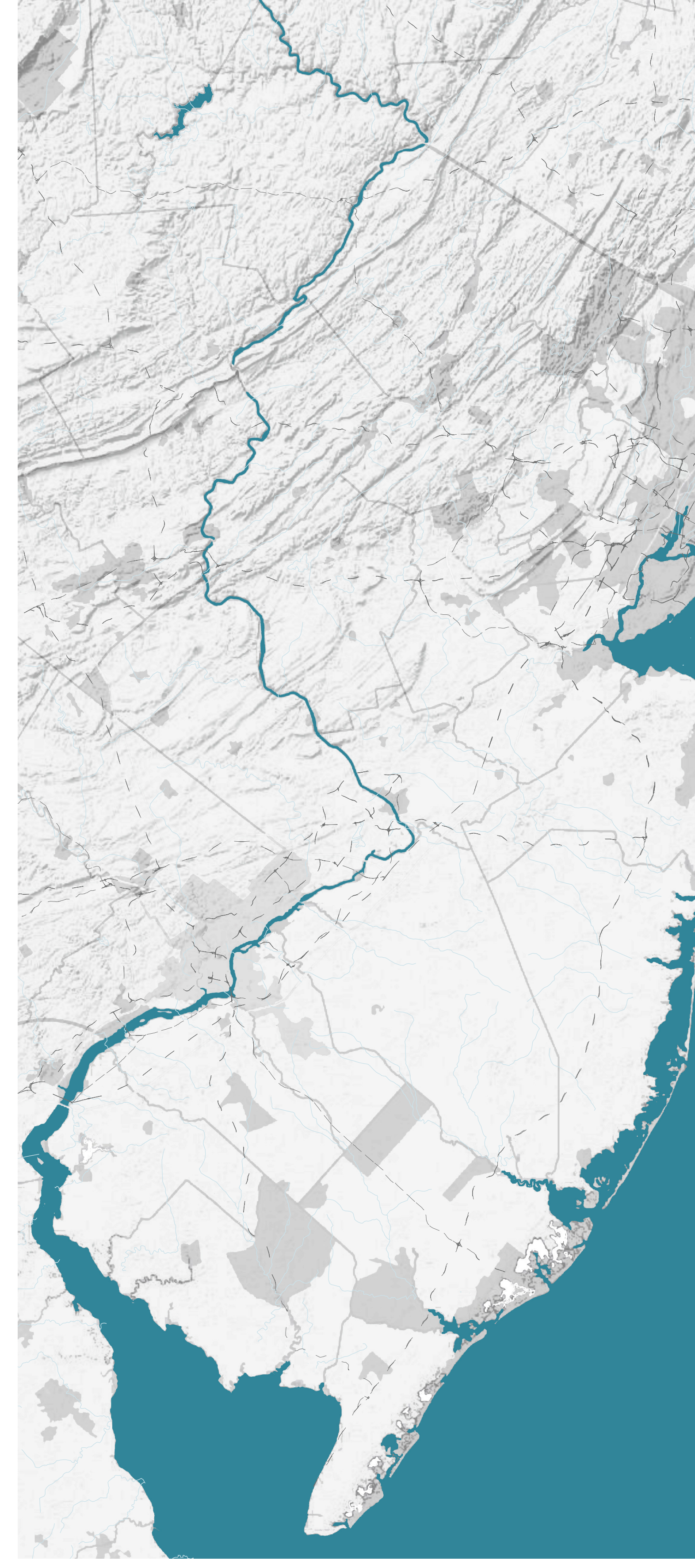
GEOGRAPHICAL OVERVIEW 0 5km 10km 25km