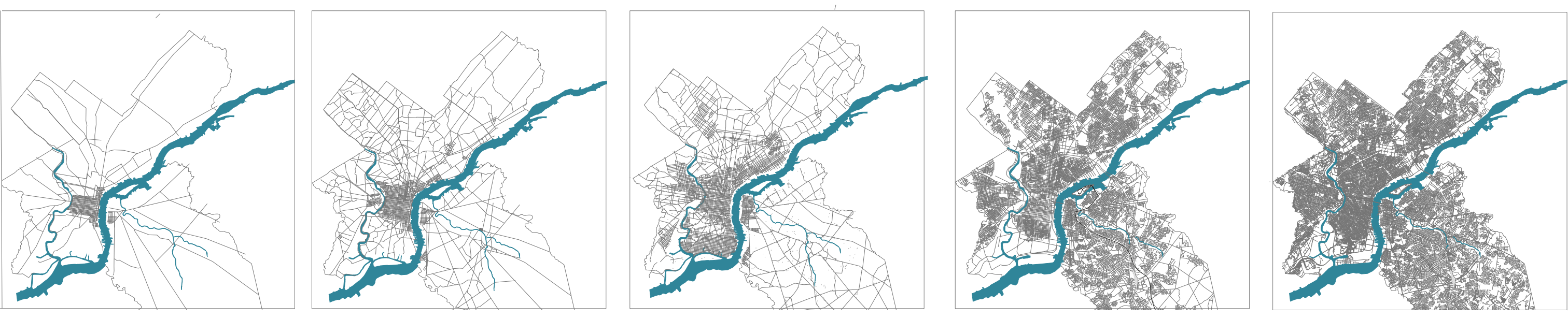
URBAN DEVELOPMENT 1750 URBAN DEVELOPMENT 1800 URBAN DEVELOPMENT 1850 URBAN DEVELOPMENT 1850 URBAN DEVELOPMENT 1900