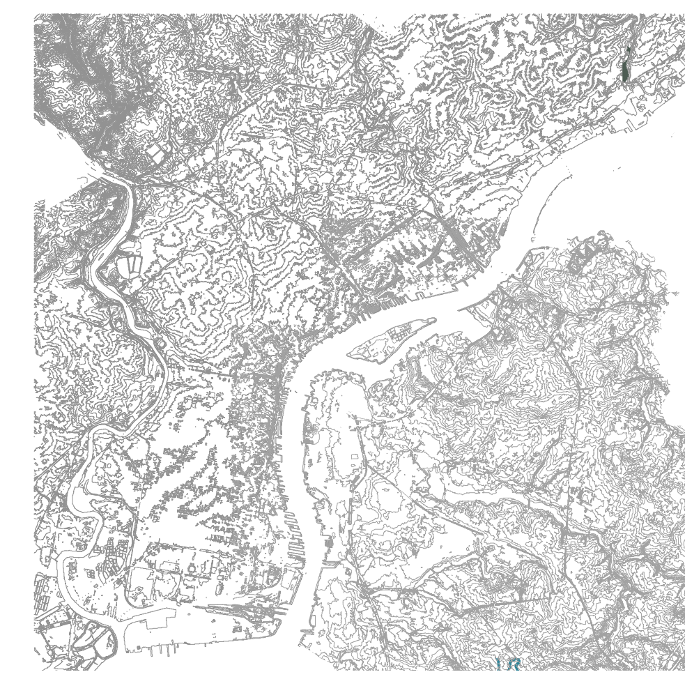
OROGRAPHICAL CONFORMATION 0 5km 10km