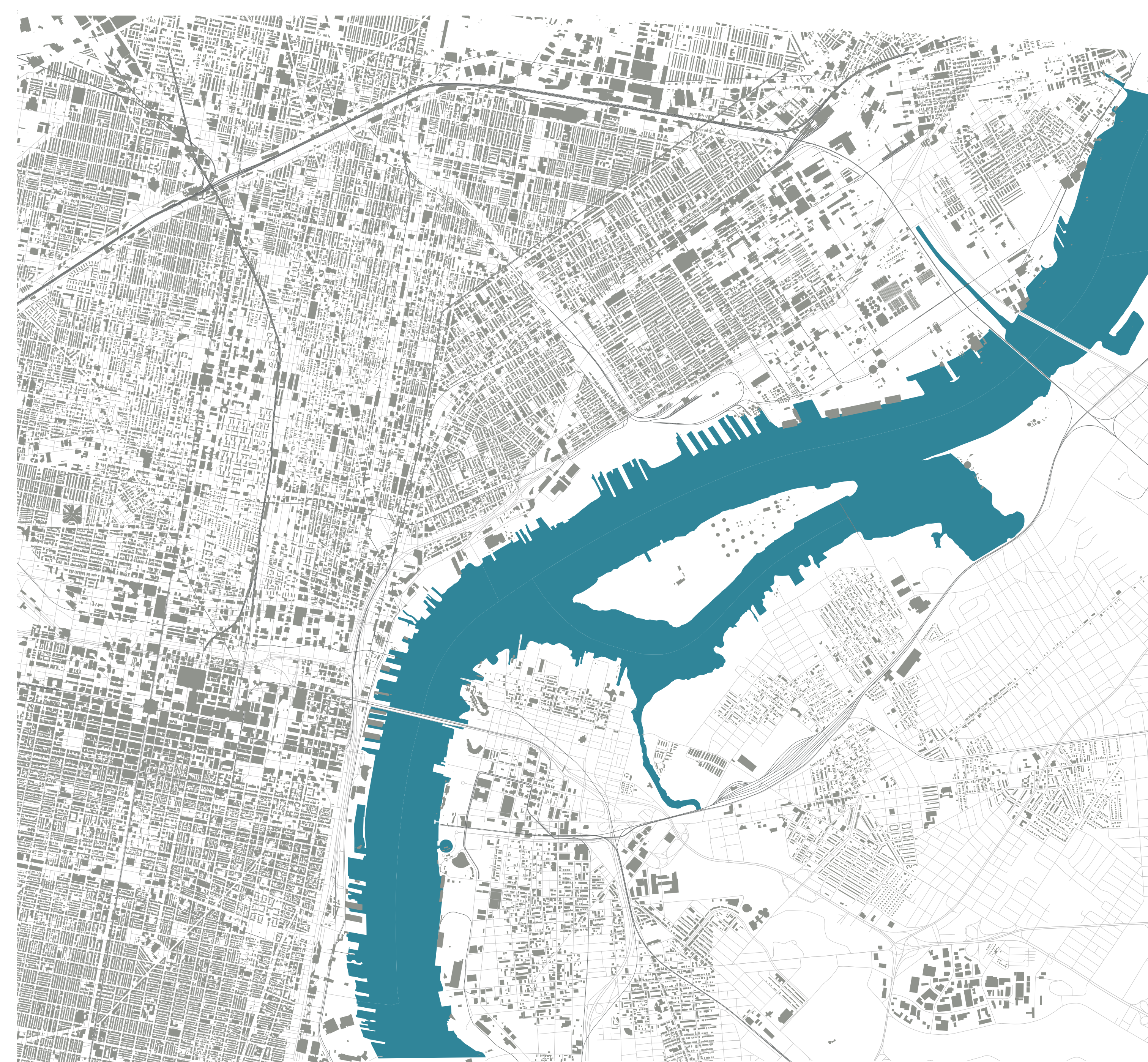
BUILD UP SPACE AND INFRASTRUCTURES