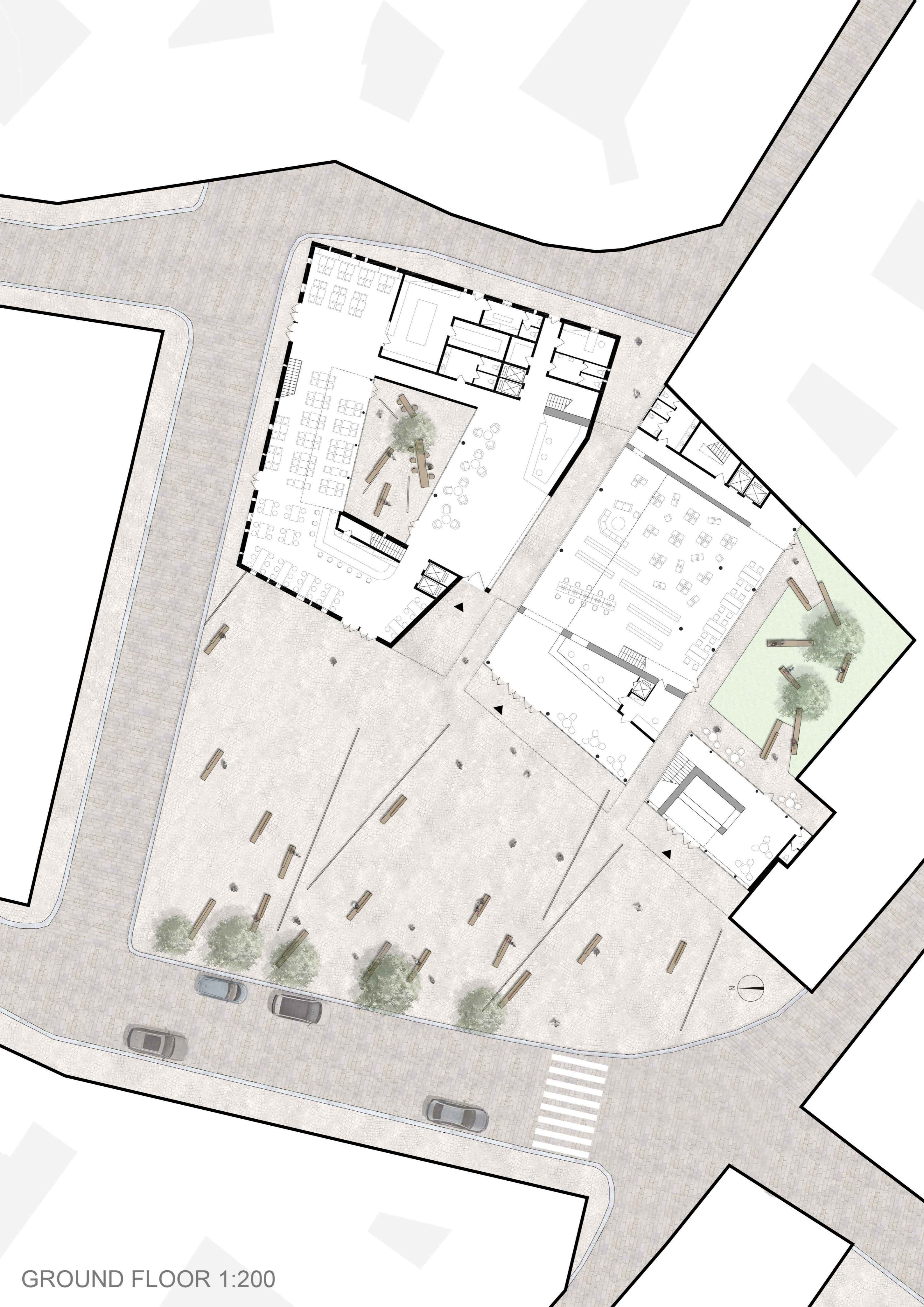
GROUND FLOOR 1:200