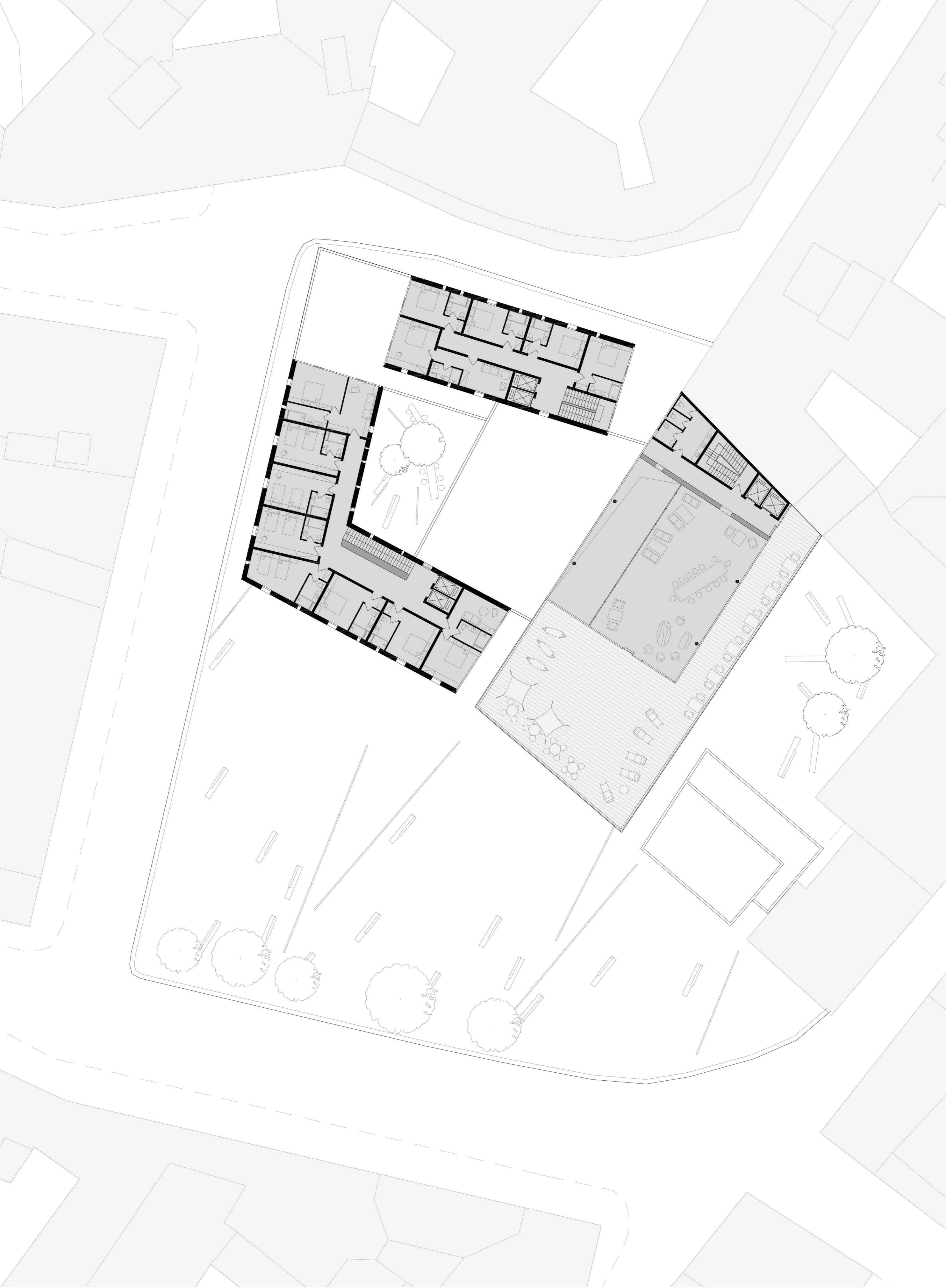
THIRD FLOOR 1:200