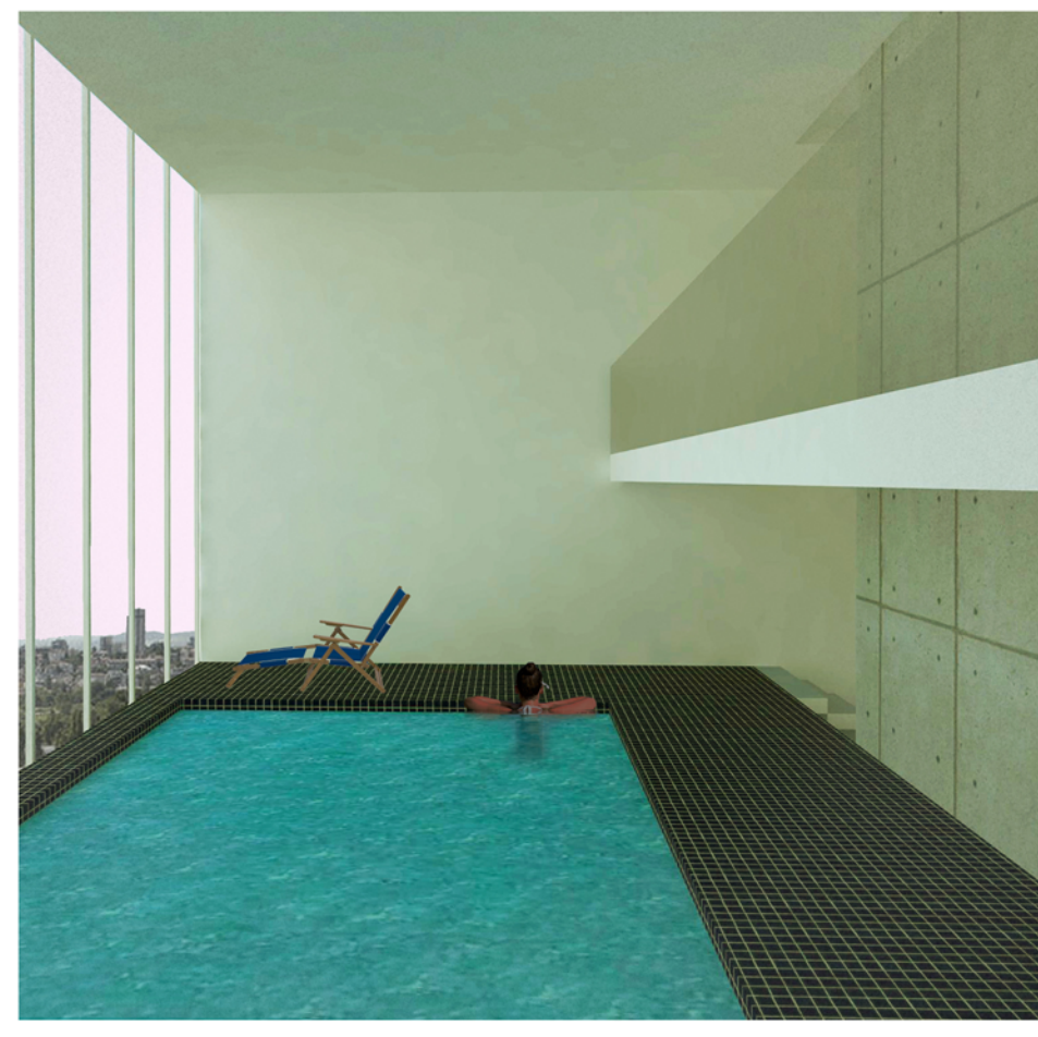
In-between apartments space