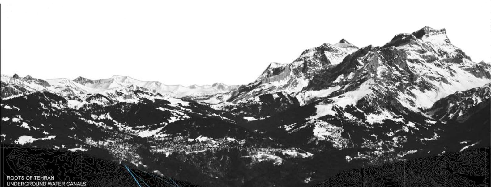
ROOTS OF TEHRAN UNDERGROUND WATER CANALS