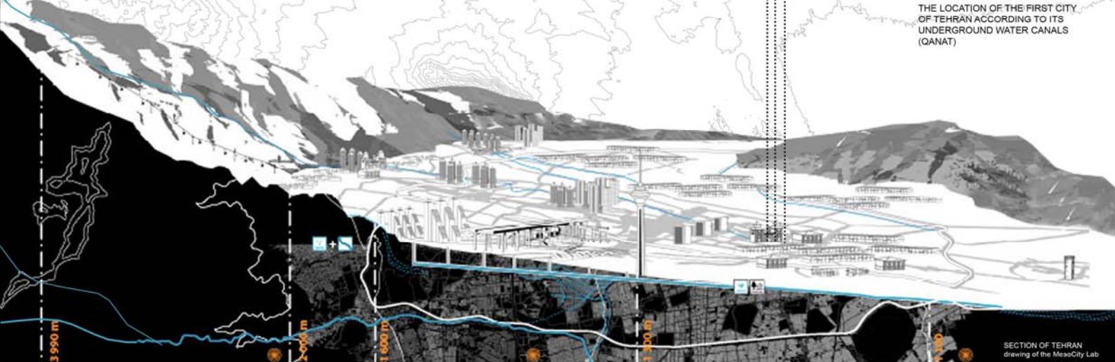
SECTION OF TEHRAN drawing of the MesoCity Lab