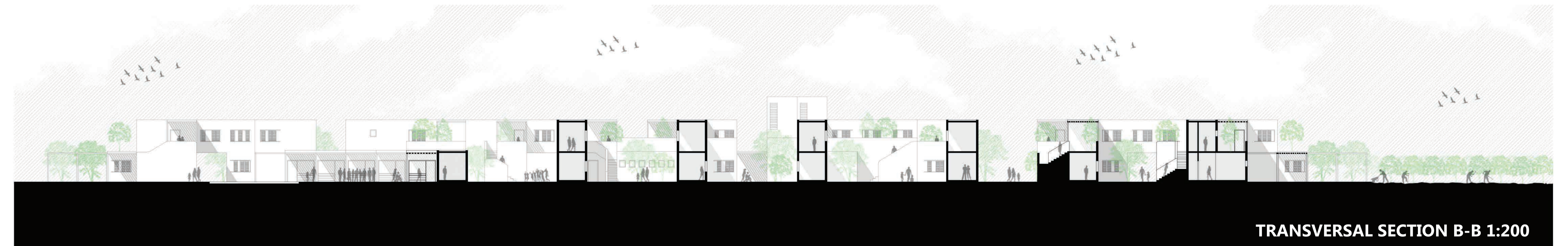
TRANSVERSAL SECTION B-B 1:200