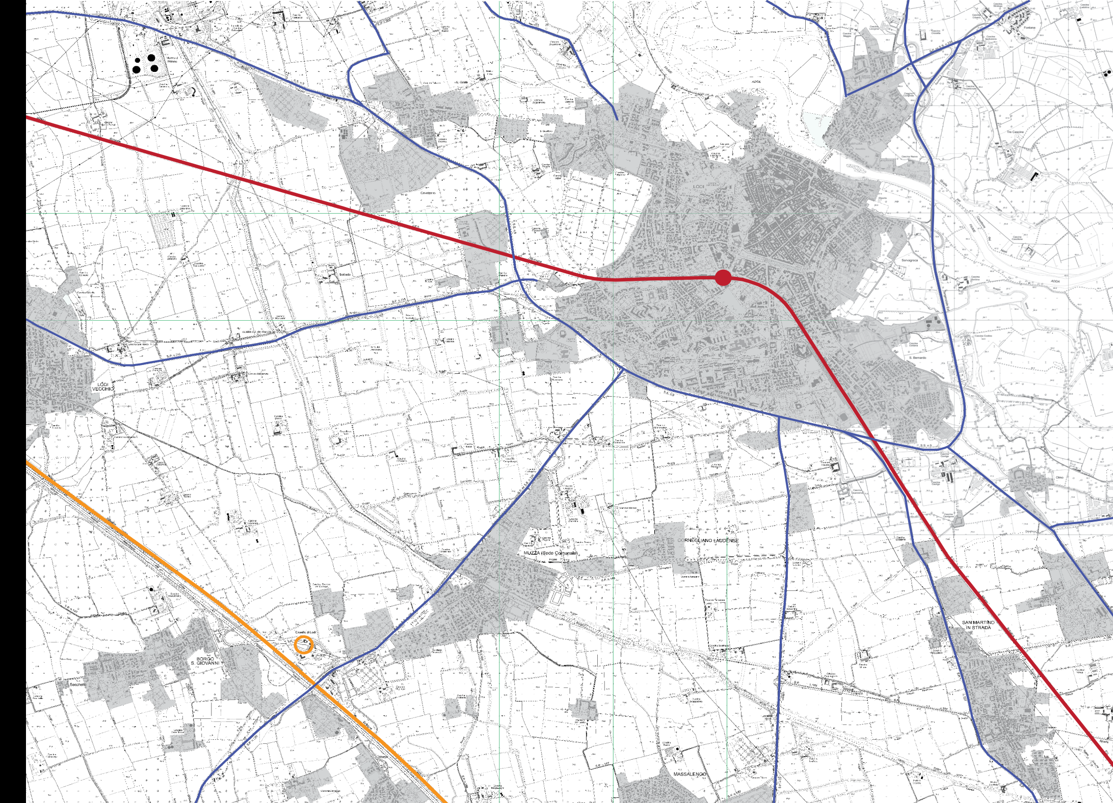
ANALISI A SCALA TERRITORIALE SCALA 1:50000