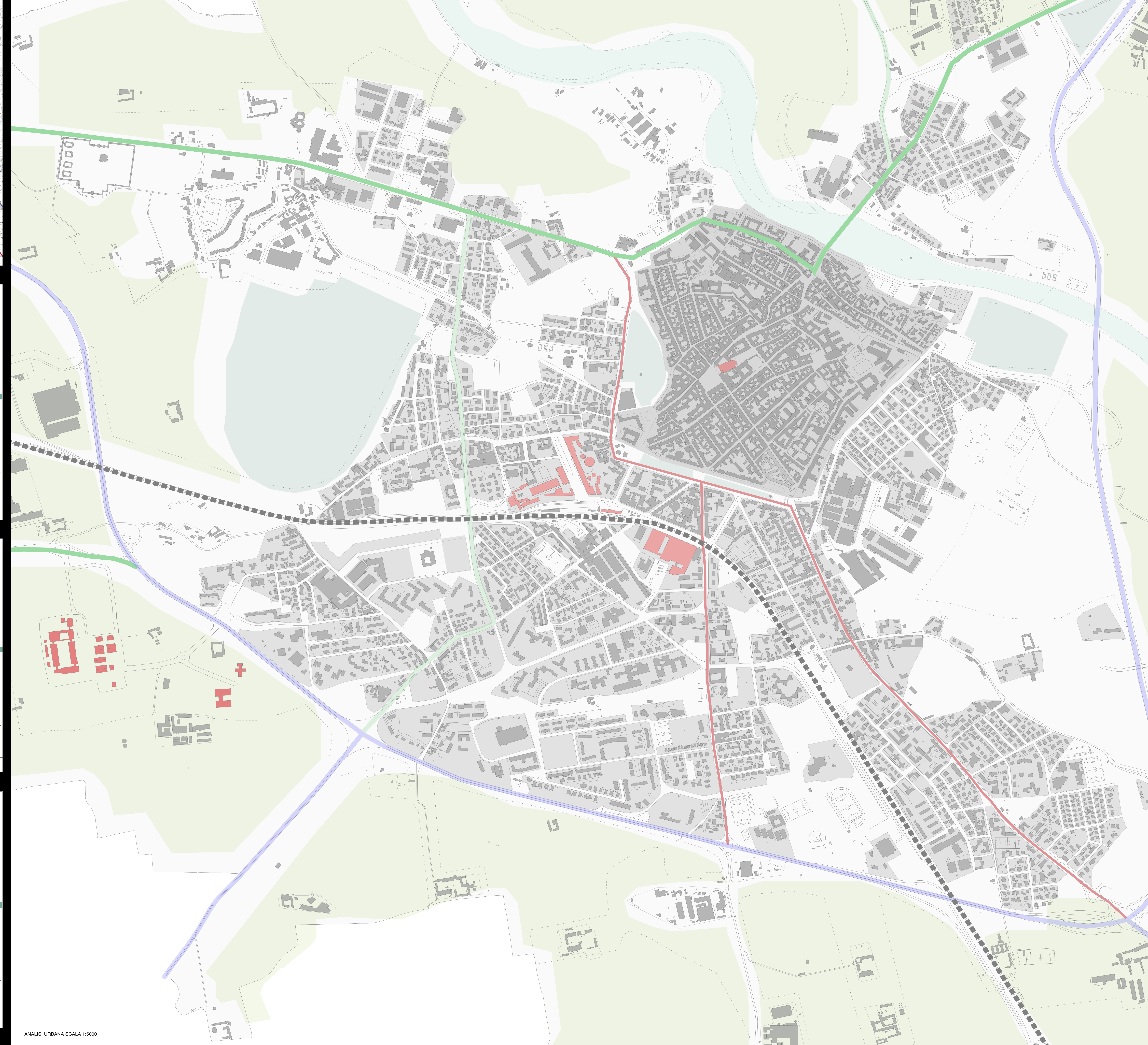
ANALISI URBANA SCALA 1:5000