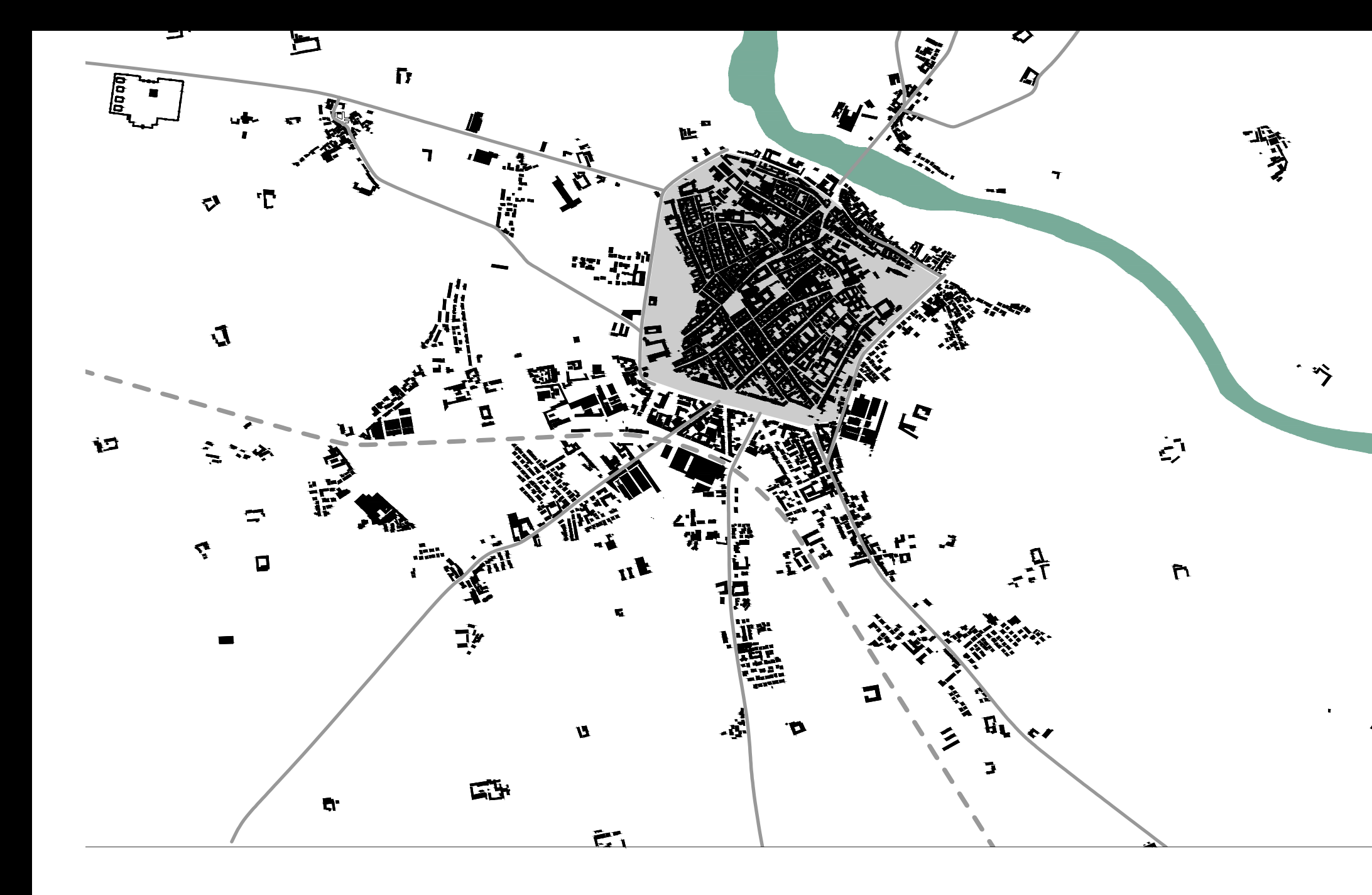
SOGLIE STORICHE DEL 1962