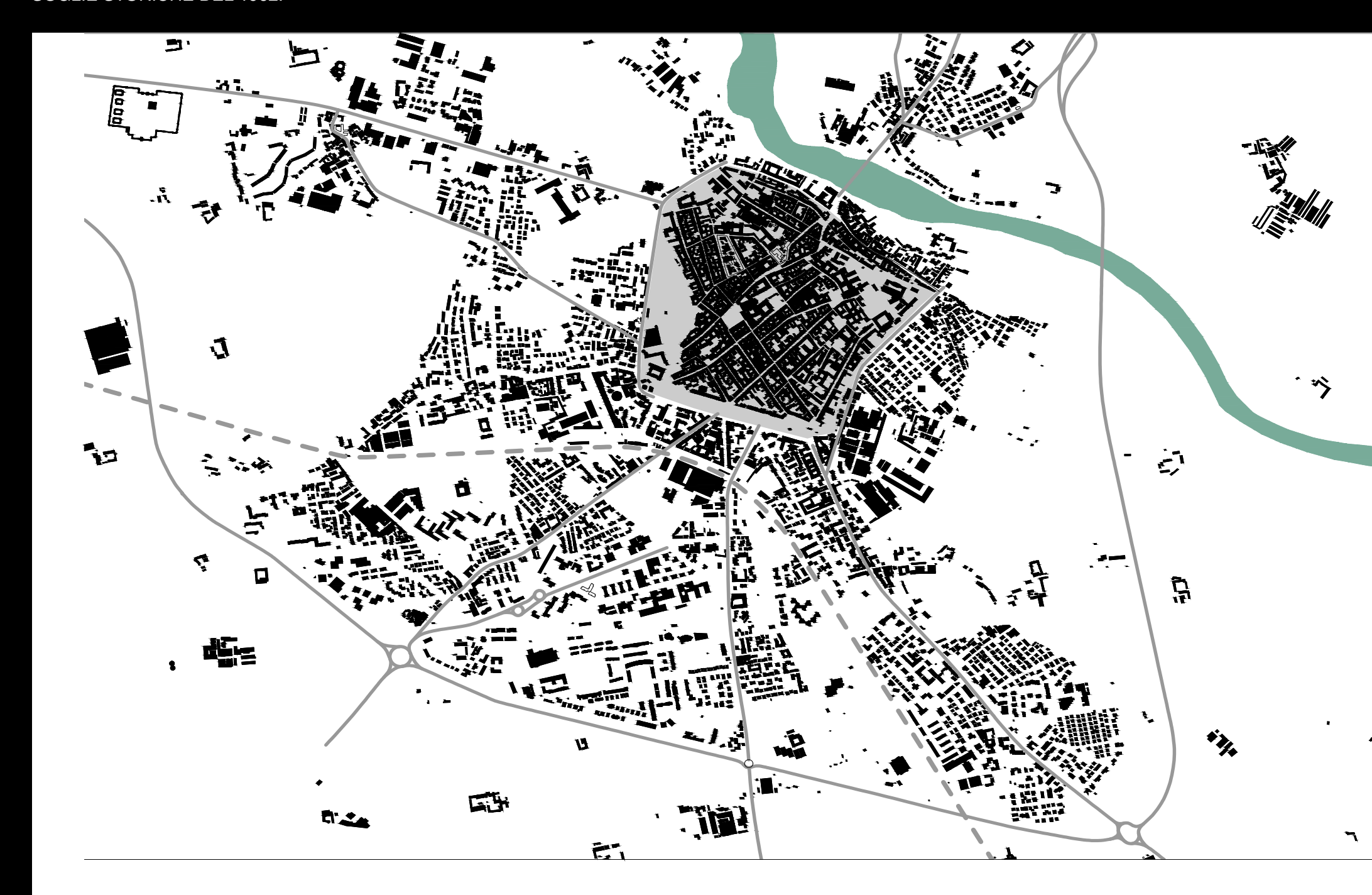
SOGLIE STORICHE DEL 2016