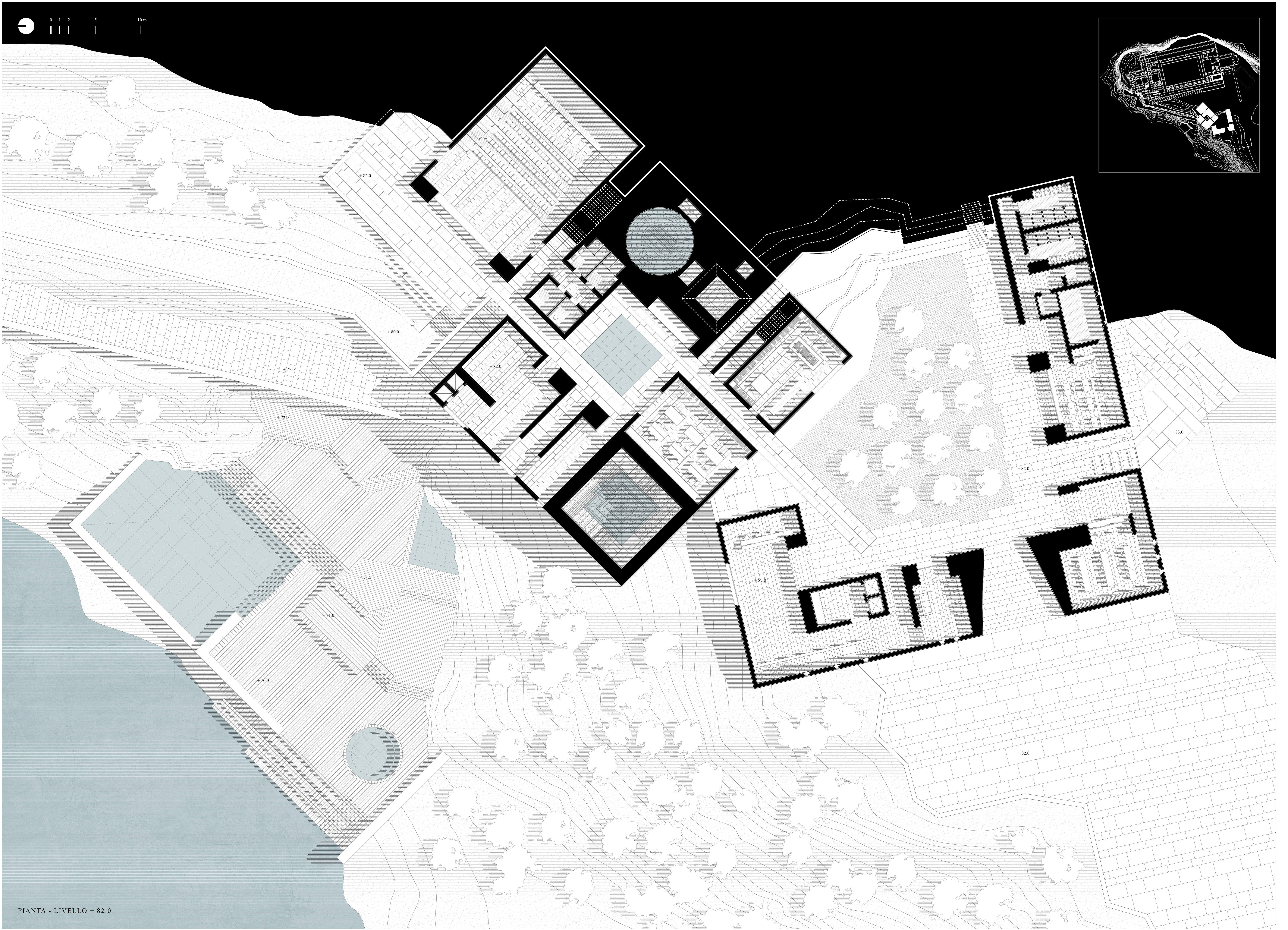
PIANTA - LIVELLO + 82.0