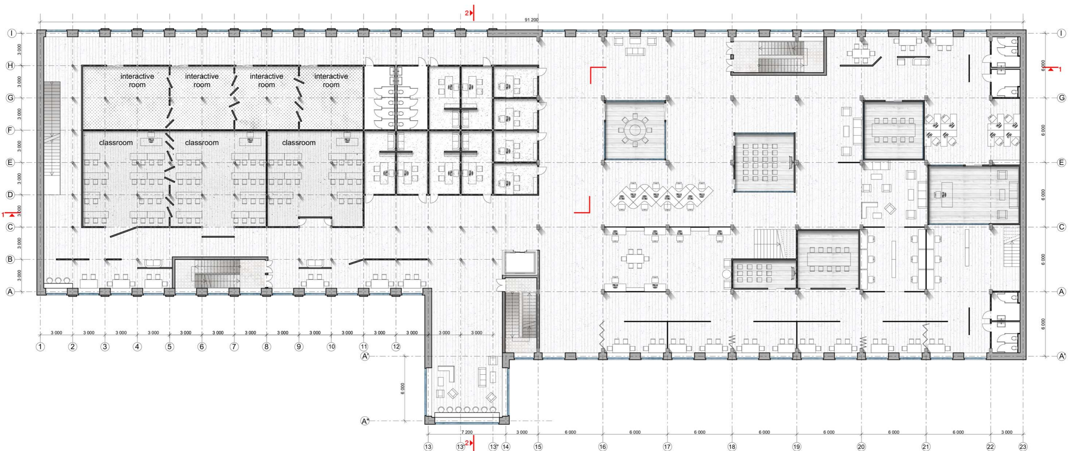
3rd floor plan