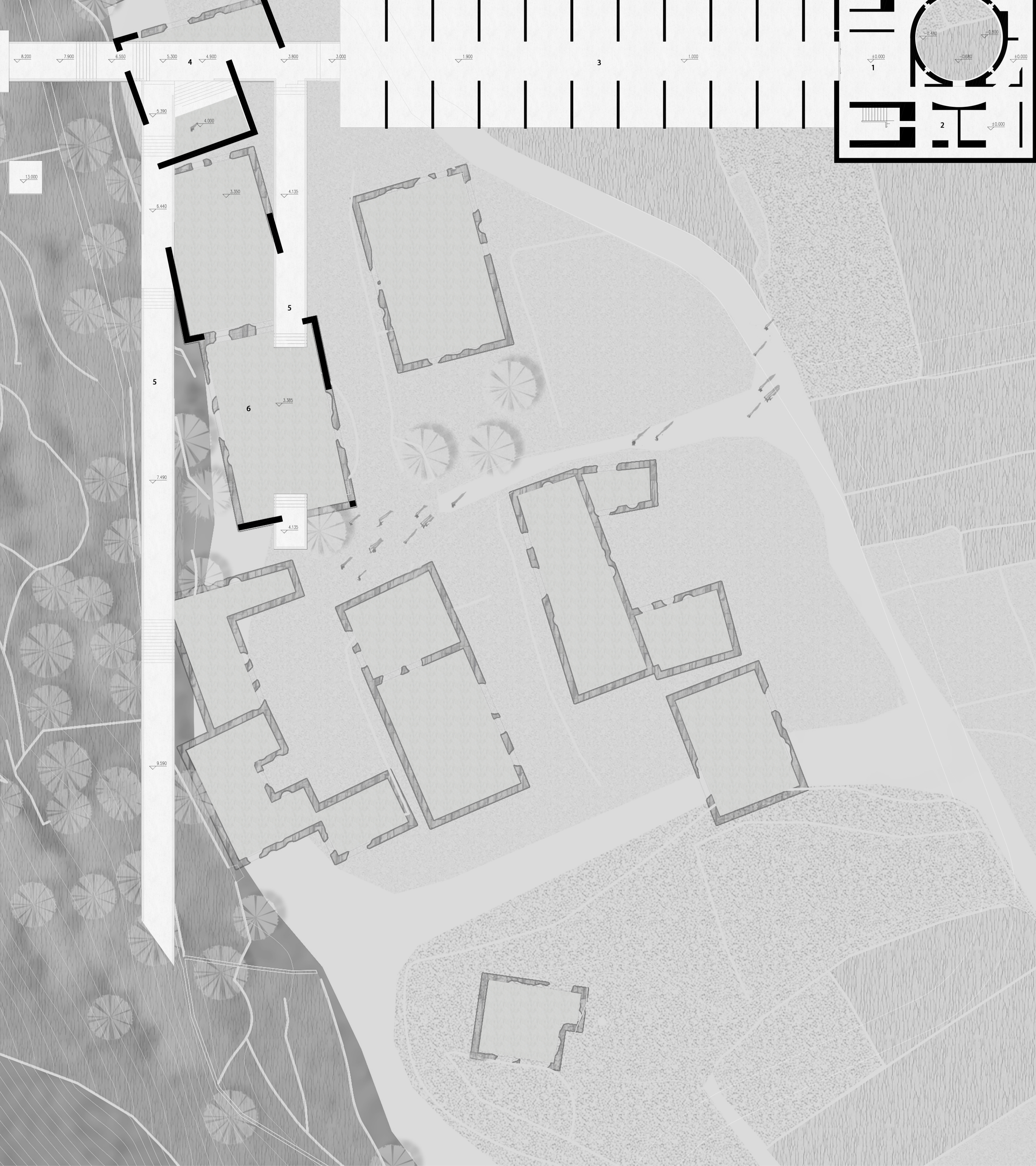
H= 3.600m FLOOR PLAN 1:200