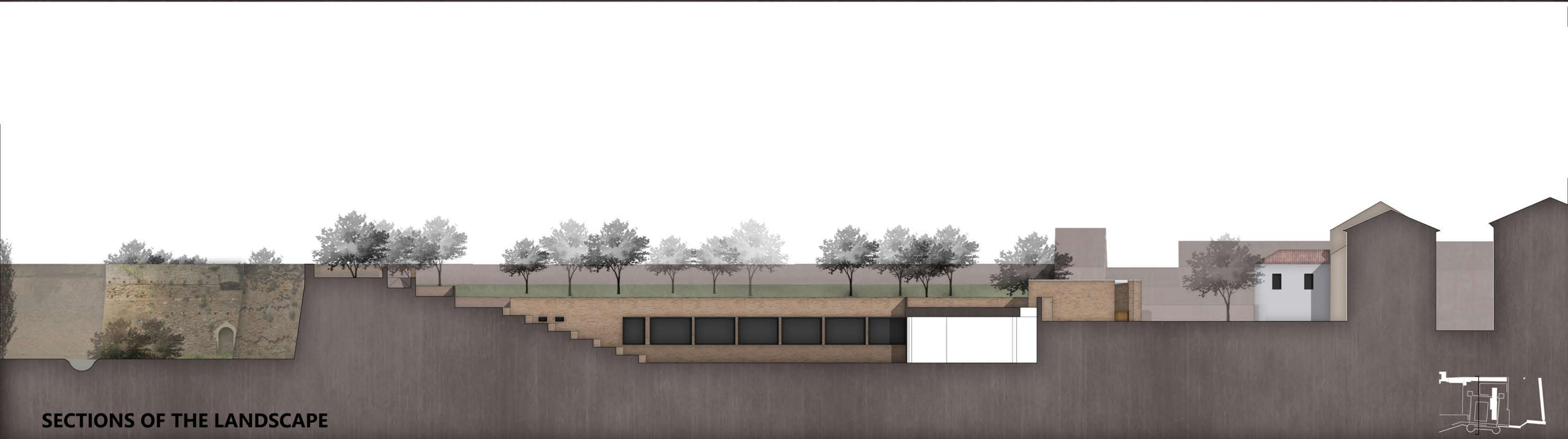
SECTIONS OF THE LANDSCAPE