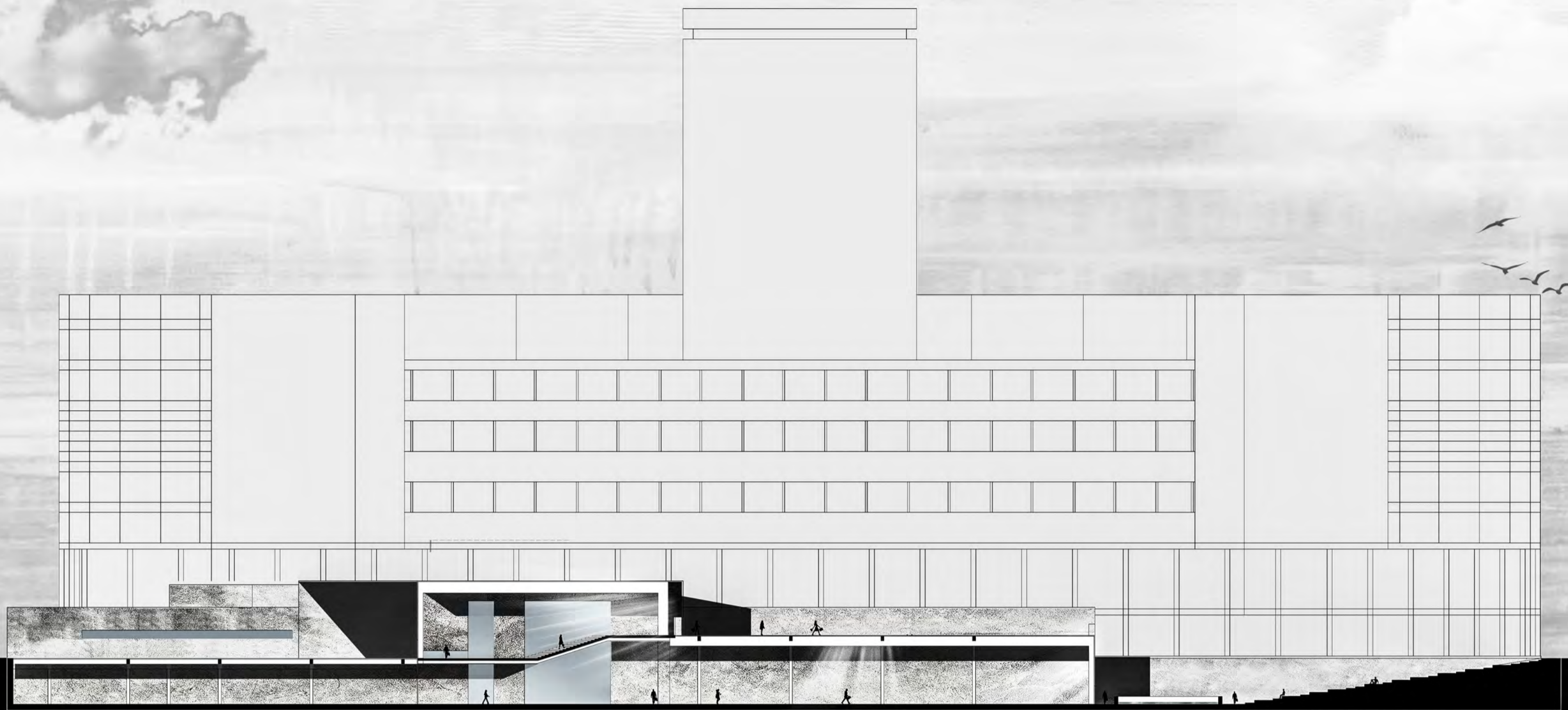
B-B SECTION 1:500