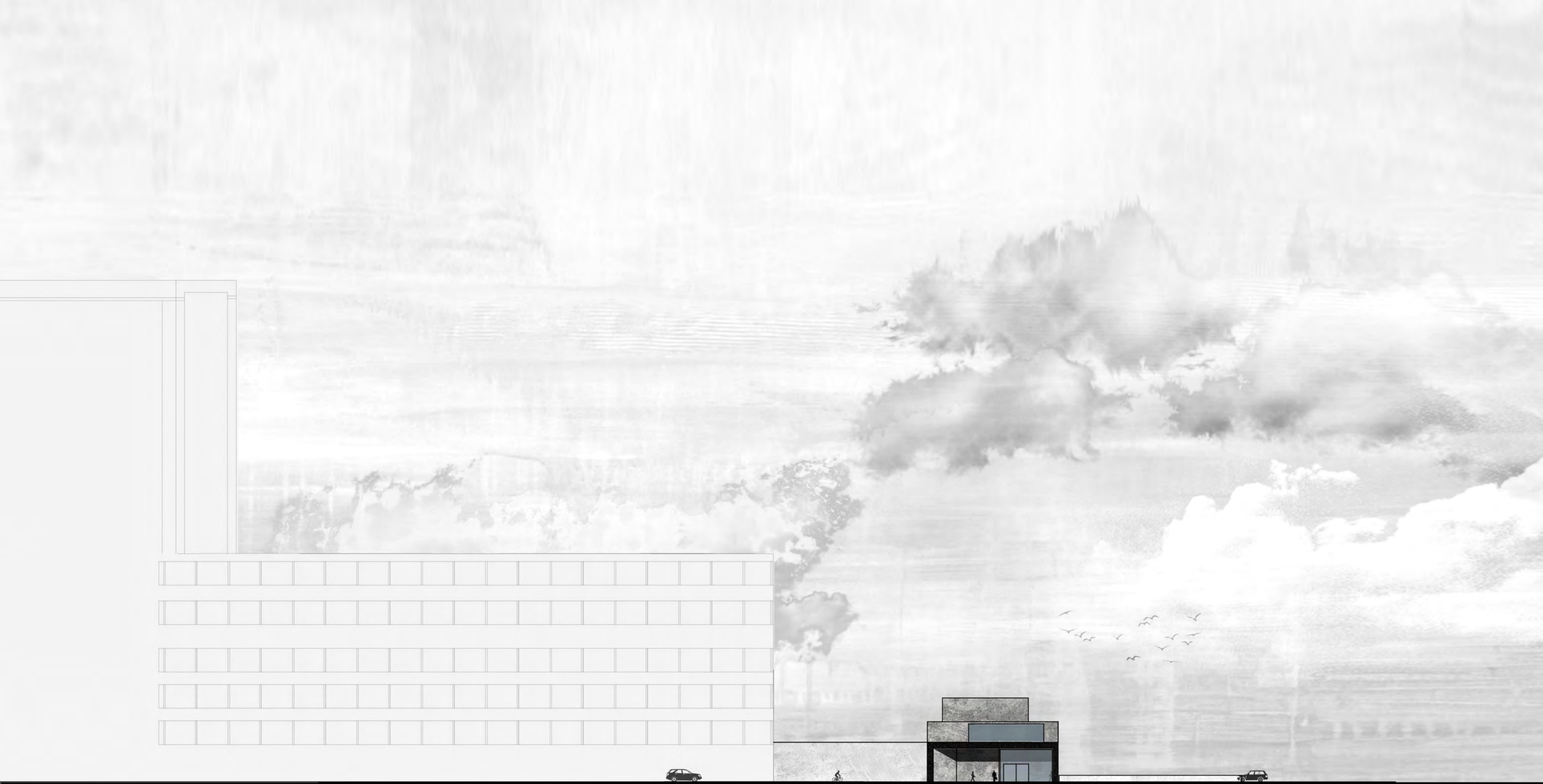
WEST ELEVATION 1:500