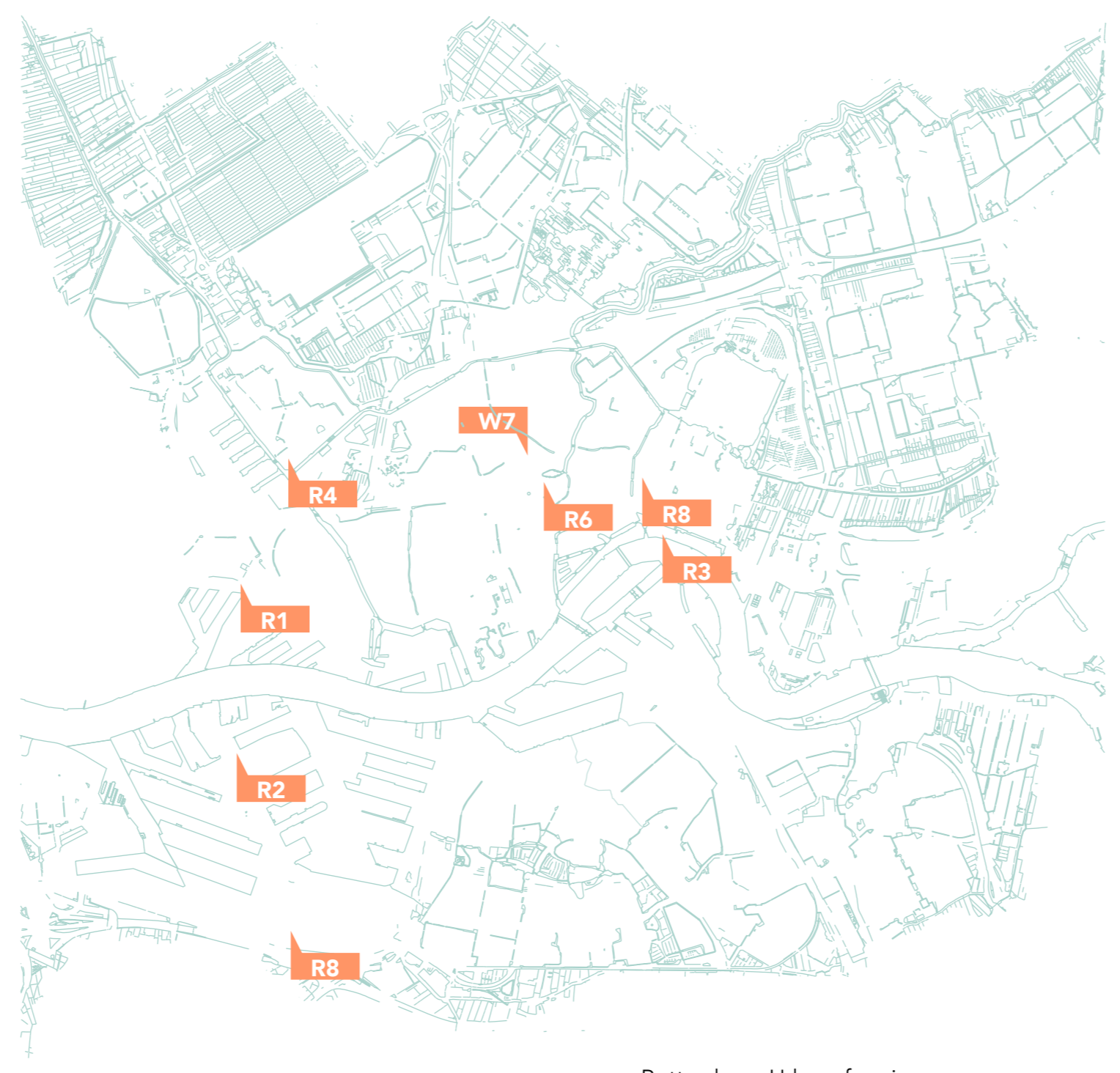
Rotterdam, Urban farming map-

UIT JE EIGEN STAD national urban farming organization, building in association the first float in urban farming in the port of Rdam