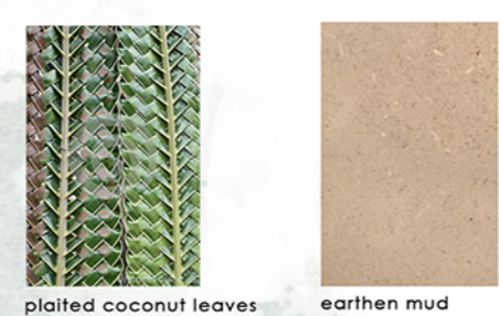
plaited coconut leaves earthen mud

Local finishing material (Plaited coconut leaves plastered with earthen mud and painted in white)